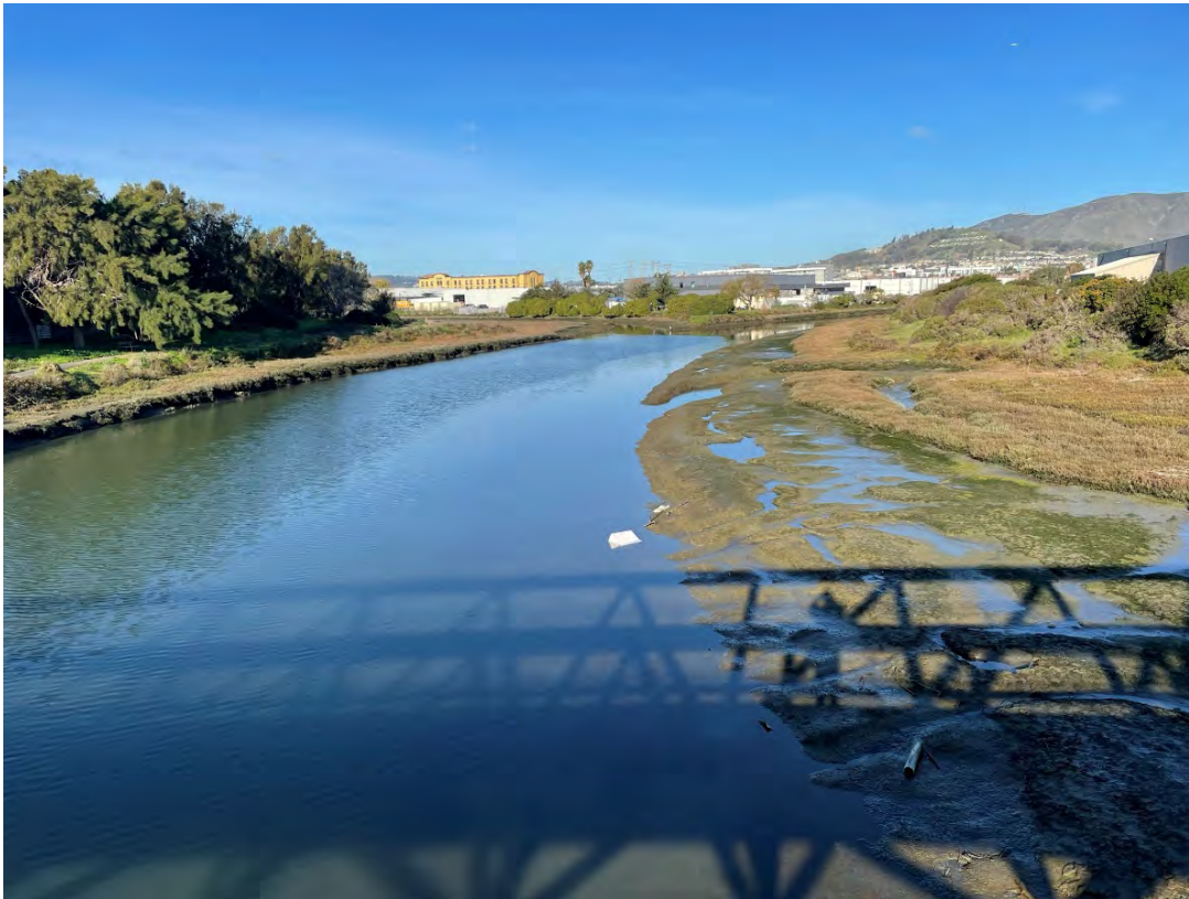
Photos 1 & 2 – Top photo shows Colma Creek looking downstream from the Bay Trail pedestrian bridge. Bottom photo shows Colma Creek looking upstream from the pedestrian bridge.