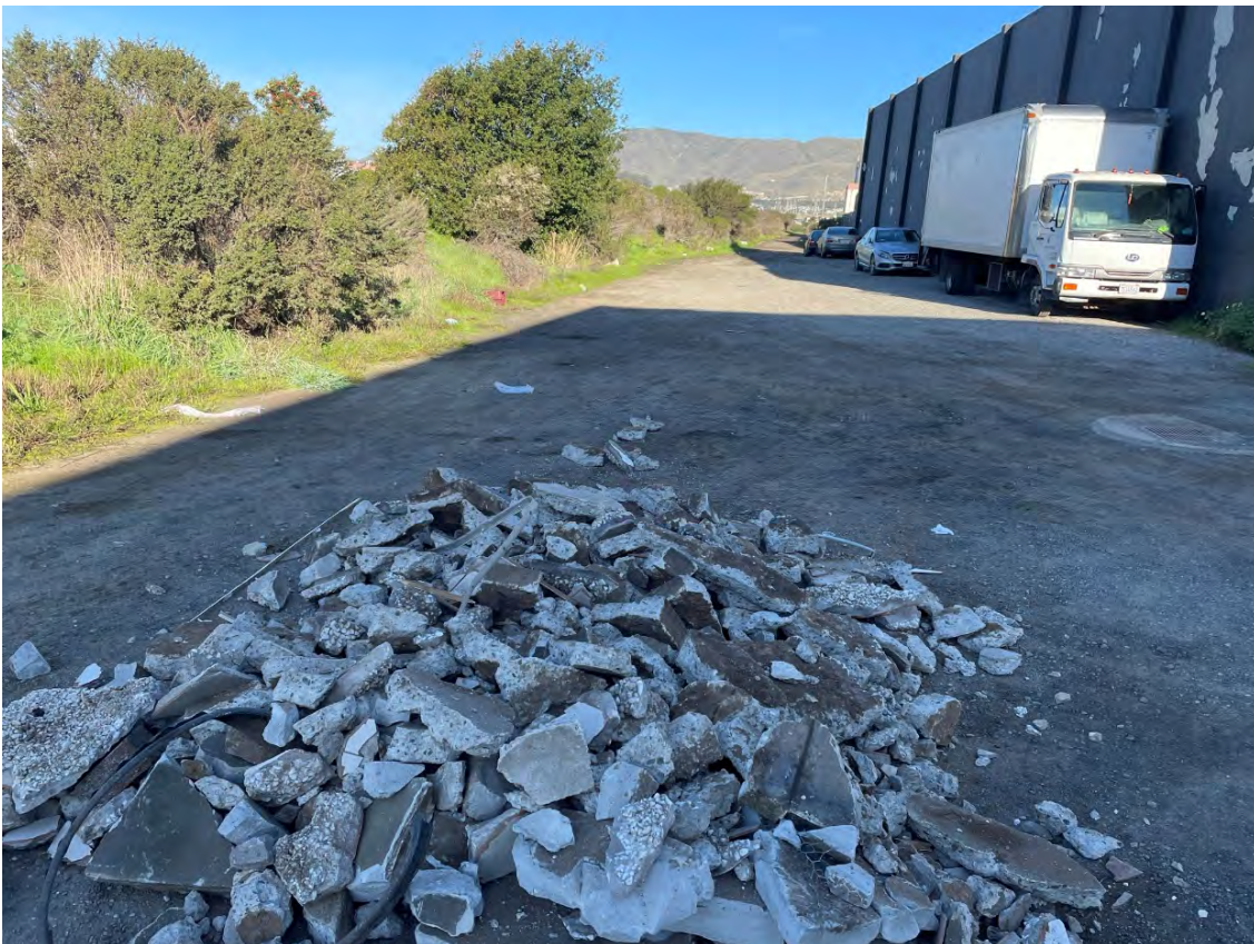
Photos 3 & 4 – Top photo shows Colma Creek confluence with Navigable Slough looking upstream from the Bay Trail. Bottom photo shows illegal dumping on the Colma Creek service road; County staff has notified SSF staff via SeeClickFix.