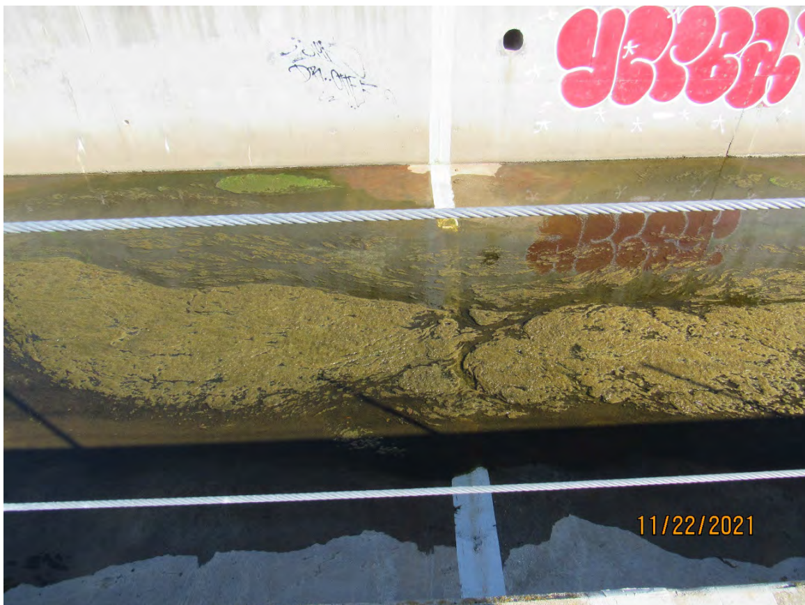
Photos 28 & 29 – Top photo shows Colma Creek looking upstream from McLellan Drive. Bottom photo shows the completed expansion joint repairs downstream of the Mission Road box culvert. Repairs were completed by County contractors in September 2021.