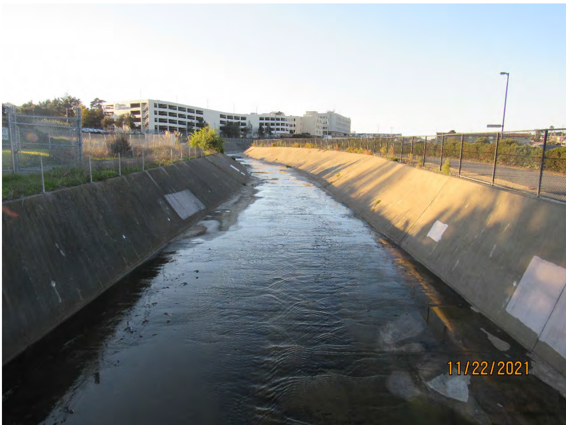
Photos 24 & 25 – Top photo shows Colma Creek looking downstream from the Centennial Way pedestrian bridge. Bottom photo shows Colma Creek looking upstream from the Centennial Way pedestrian bridge.