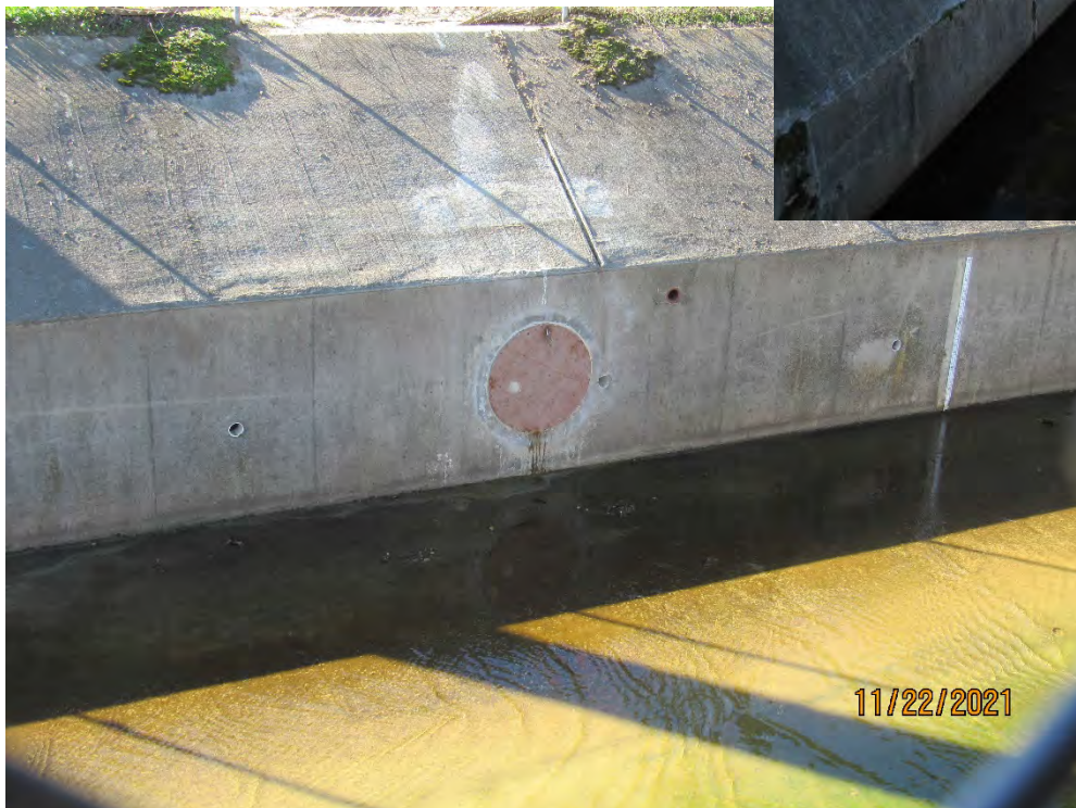
Photos 21, 22 & 23 – Top photo shows Colma Creek looking downstream from the Orange Avenue bridge. Middle photo shows Colma Creek looking upstream from the Orange Avenue bridge. Construction of the Orange Memorial Park Storm Water Capture Project can be seen on the south bank. Bottom photo shows recently constructed outflow culvert for the Orange Memorial Park Storm Water Capture Project upstream of the Orange Avenue bridge.