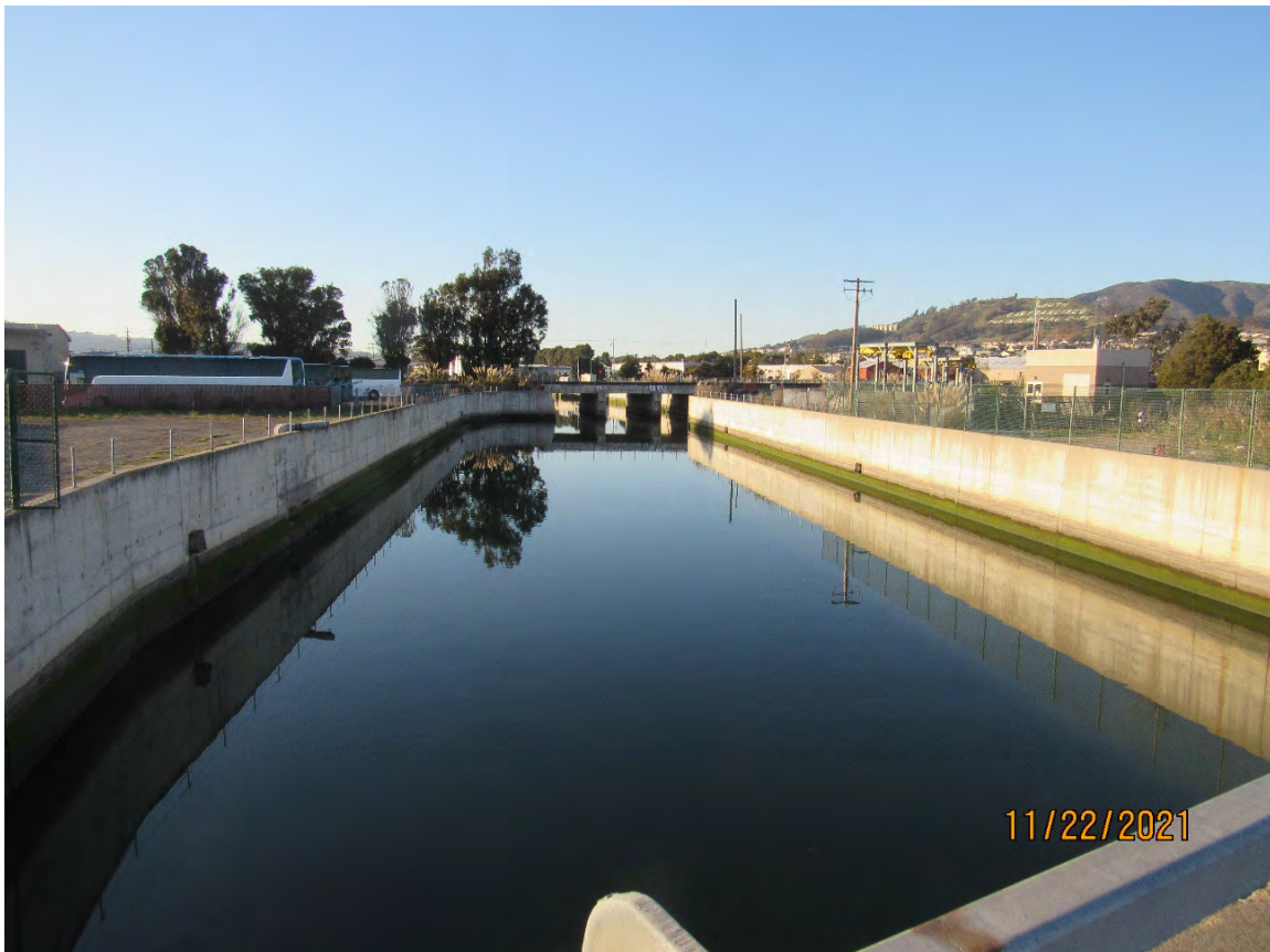
Photos 17 & 18 – Top photo shows Colma Creek looking downstream from the San Mateo Avenue bridge. Bottom photo shows Colma Creek looking upstream from the San Mateo Avenue Bridge.