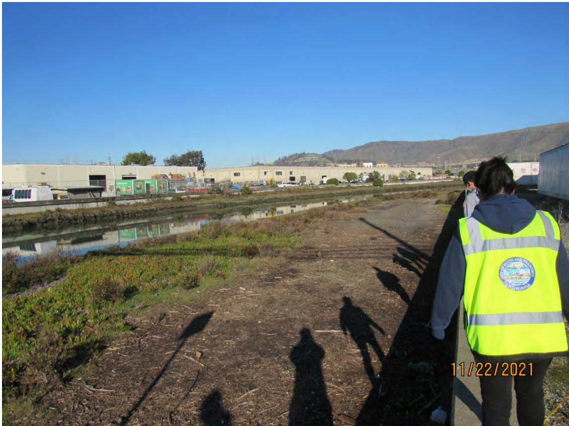
Photos 5 & 6 – Top photo shows Colma Creek looking downstream from the Utah Avenue bridge at Mitigation Site 2. The bottom photo shows Colma Creek looking upstream from the Utah Avenue bridge.