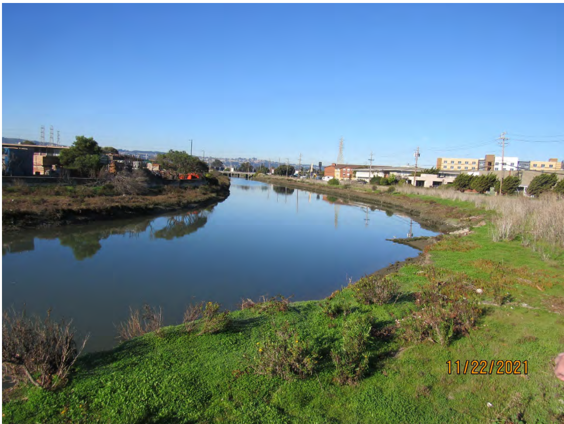
Photos 7 & 8 – Top photo shows Colma Creek looking downstream toward the Utah Avenue bridge. Bottom photo shows Colma Creek looking upstream toward the S. Airport Blvd. bridge.