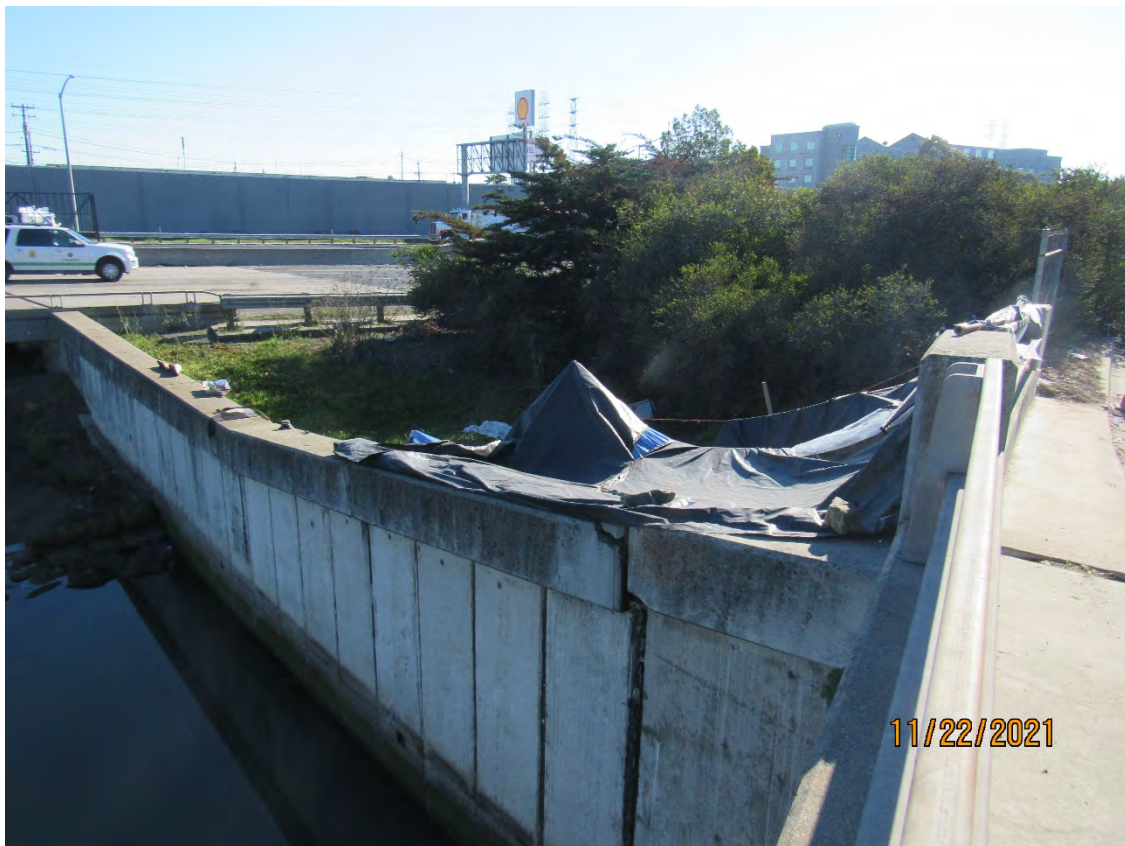
Photos 13 & 14 – Top photo shows Colma Creek looking downstream towards the Highway 101 bridge. Bottom photo shows new homeless encampment on the southeast bank of Colma Creek at the Produce Avenue bridge. County staff has notified SSFPD; SSF and Caltrans are aware of the encampment.