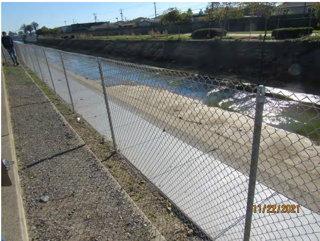
Photos 19 & 20 – Top photo shows Colma Creek looking upstream from the Spruce Avenue Bridge. Bottom photo shows newly repaired sidewalk on the north bank of Colma Creek upstream of the Spruce Avenue Bridge; repairs were completed by County contractors in September 2021.