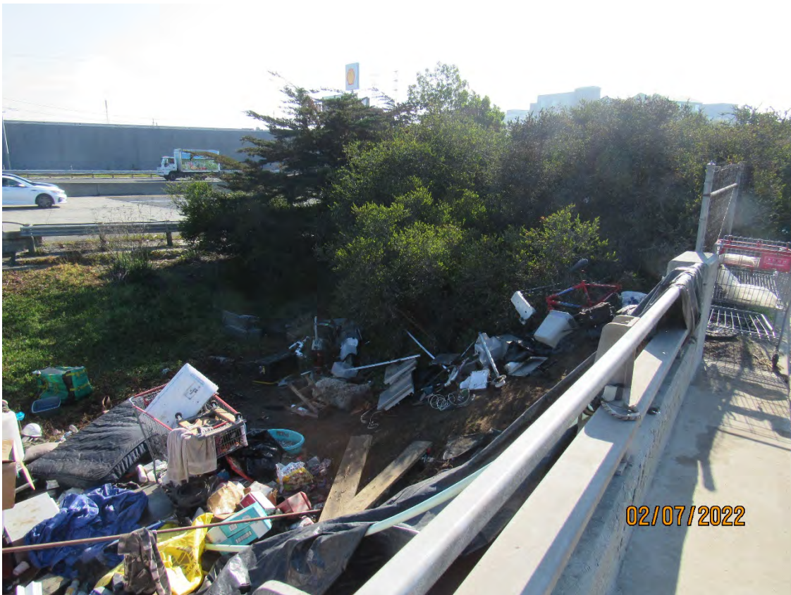
Photos 13 & 14 – Top photo shows Colma Creek looking downstream towards the Highway 101 bridge. Bottom photo shows new homeless encampment on the southeast bank of Colma Creek at the Produce Avenue bridge. SSF Police Department and Caltrans are aware of the encampment.