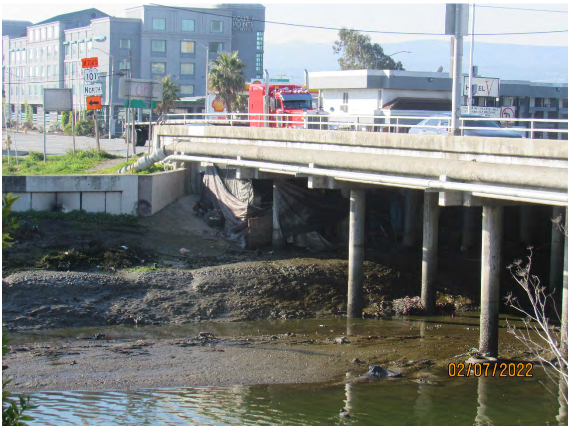
Photos 7 & 8 – Top photo shows Colma Creek looking upstream toward the S. Airport Blvd. bridge. Bottom photo shows homeless encampment beneath the S. Airport Blvd. bridge.