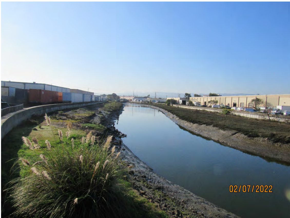
Photos 5 & 6 – Top photo shows Colma Creek looking upstream from the Utah Avenue bridge. Bottom photo shows Colma Creek looking downstream toward the Utah Avenue bridge.