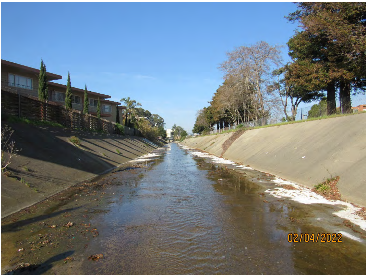
Photos 27 & 28 – Top photo shows exposed rebar on the upstream side of the Chestnut Avenue bridge. County staff recommend including this site in the 2022 maintenance list to address exposed rebar. Bottom photo shows Colma Creek looking upstream from the Chestnut Avenue bridge.