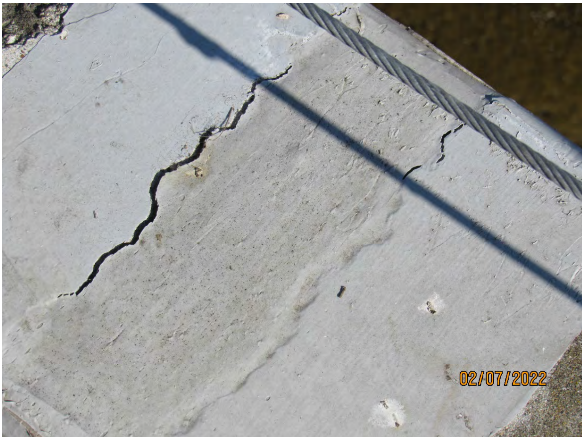
Photos 35 & 36 – Top and bottom photos show epansion joint repairs made during 2021 in the channel segment between Mission Road box culvert and McLellan Drive. Some joints are exhibiting peeling and cracking. County staff will contact contractor for repairs per terms of the warranty.