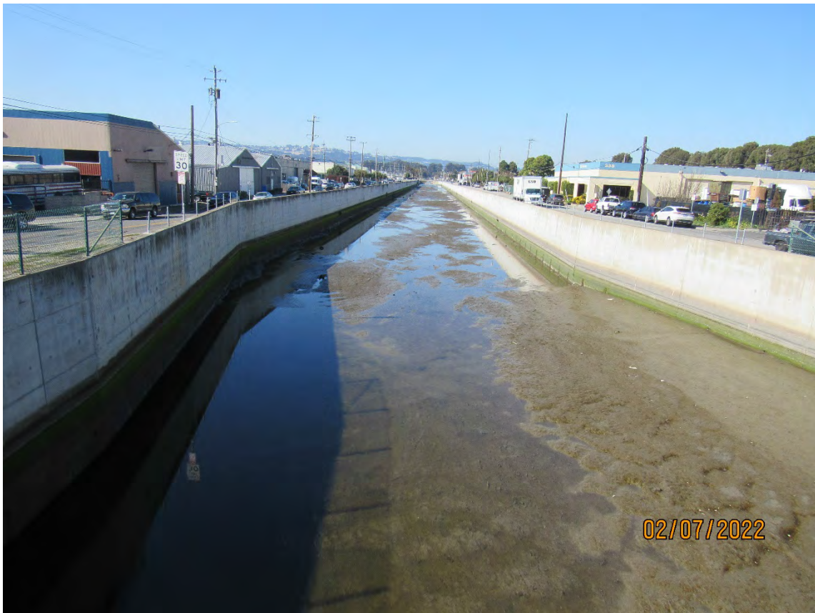
Photos 19 & 20 – Top photo shows Colma Creek looking downstream from the Linden Avenue bridge. Bottom photo shows Colma Creek looking upstream from the Linden Avenue bridge.