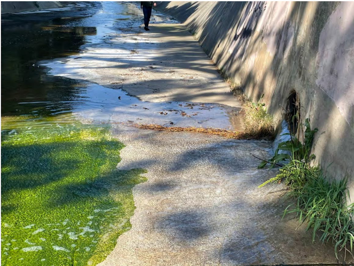
Photos 25 & 26 – Top photo shows Orange Memorial Park Stormwater Capture Project flow diversion gate currently closed as the project is still under construction. Channel bottom was also reconstructed to facilitate diversion of flow. Bottom photo shows chlorinated water being discharged into the channel from a culvert upstream of the 12-mile Creek confluence. SSF Environmental Compliance will conduct an investigation.