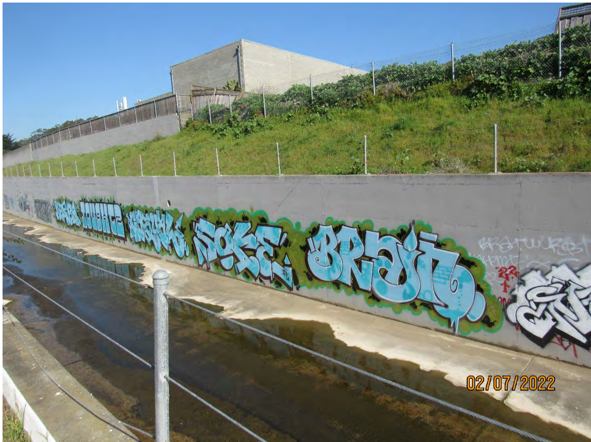
Photos 33 & 34 – Top photo shows Colma Creek looking downstream from the Costco pedestrian bridge. Bottom photo shows new graffiti between the Costco pedestrian bridge and the Mission Road culvert. County staff recommend the Town of Colma conduct graffiti abatement in this segment of the channel under the MOA with OneShoreline.