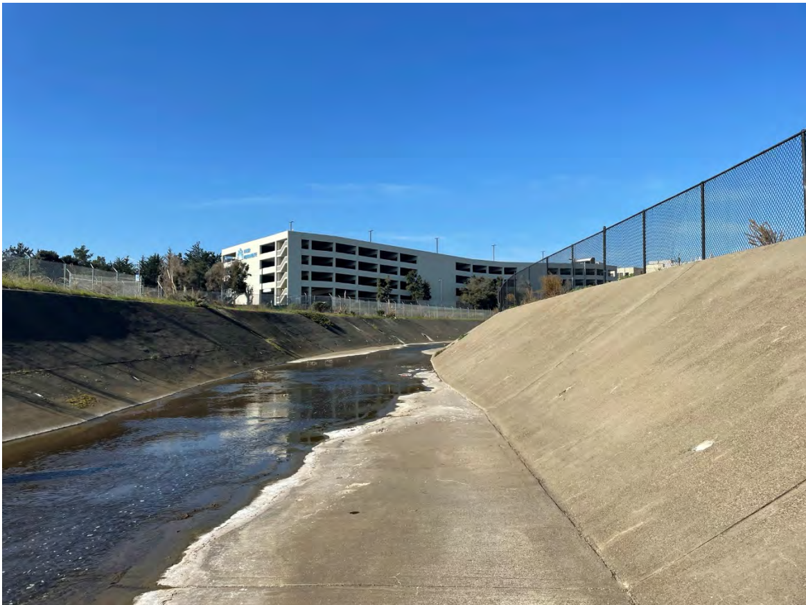
Photos 29 & 30 – Top photo shows vegetation growing through a CMP culvert outlet located between the Centennial Way pedestrian bridge and the Chestnut Avenue bridge even though the culvert was repaired in 2018, possibly due to accumulated sediment. Bottom photo shows Colma Creek looking upstream from the Centennial Way pedestrian bridge.