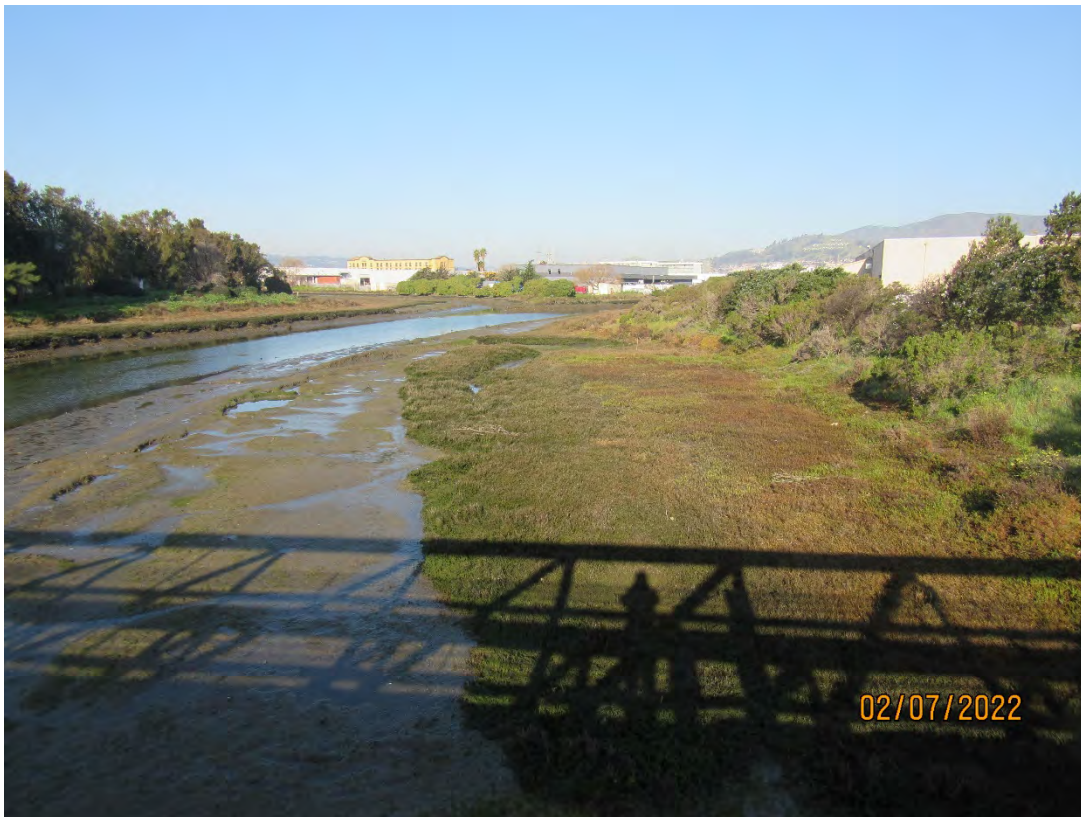
Photos 1 & 2 – Top photo shows Colma Creek looking downstream from the Bay Trail pedestrian bridge. Bottom photo shows Colma Creek looking upstream from the pedestrian bridge.