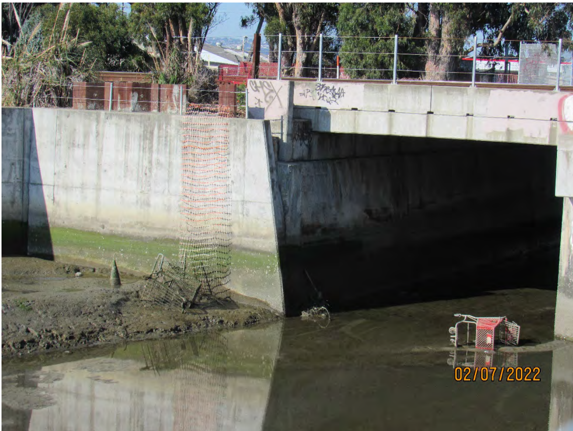
Photos 17 & 18 – Top photo shows Colma Creek looking upstream from the San Mateo Avenue Bridge. Bottom photo shows illegal dumping/vandalism at the CalTrain bridge. SSF staff is aware of the illegal activities.