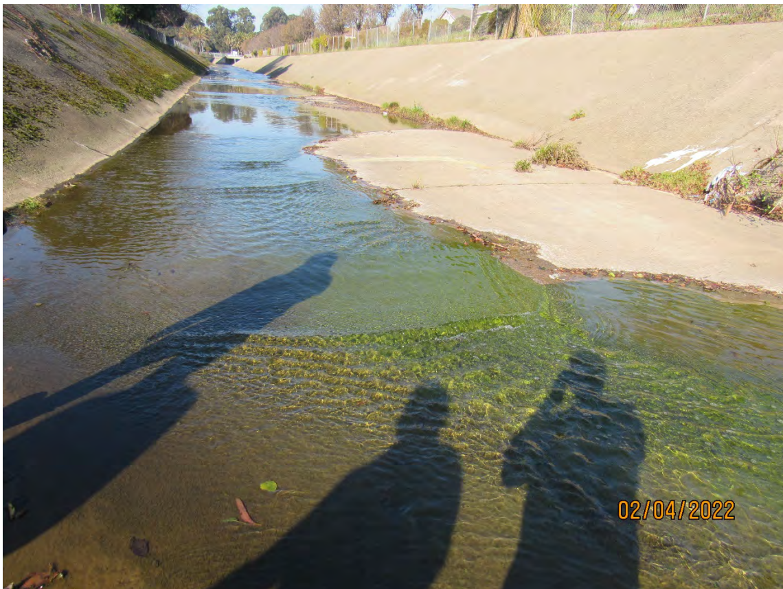
Photos 23 & 24 – Top photo shows exposed rebar at the joint between the wall and the channel bottom at multiple locations between the Spruce Avenue and Orange Avenue bridges. County staff recommend including this site in the 2022 maintenance list to address exposed rebar. Bottom photo shows Colma Creek looking upstream toward the Orange Avenue bridge from within the channel.