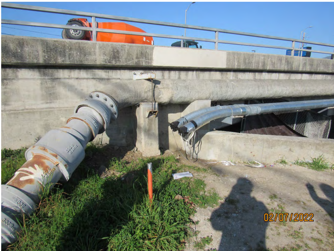
Photos 9 & 10 – Top photo shows Colma Creek looking downstream from the S. Airport Blvd. bridge. Bottom photo shows new conduits attached to the S. Airport Blvd. bridge for a fiberoptic lines installation project.