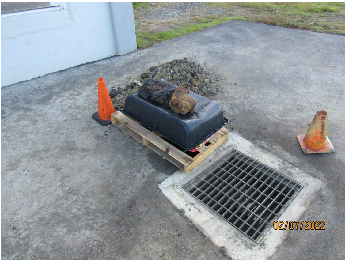
Photos 3 & 4 – Top photo shows new homeless encampment on the Colma Creek Service Road downstream of Utah Avenue. Bottom photo shows new work conducted on the storm drain inlet at 180 Utah Avenue. County staff has notified SSF staff via SeeClickFix.