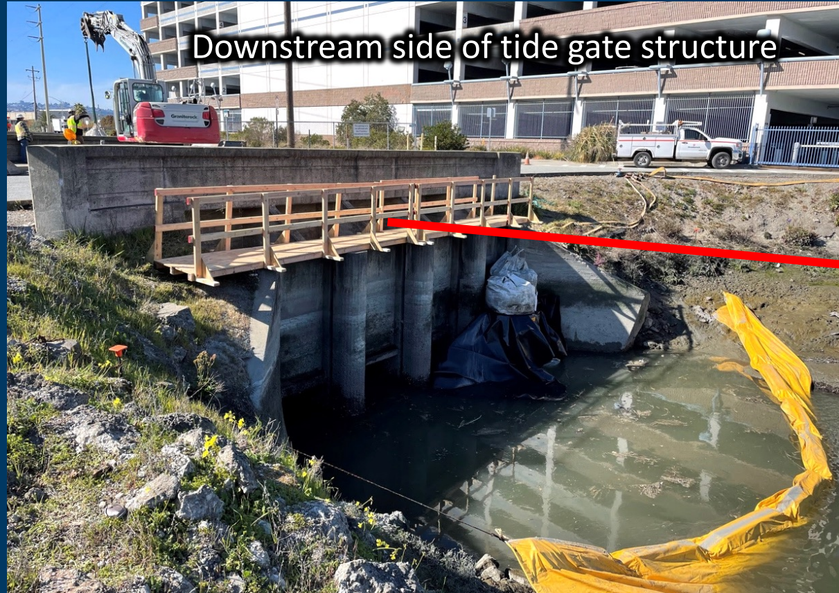
Downstream side of tide gate structure