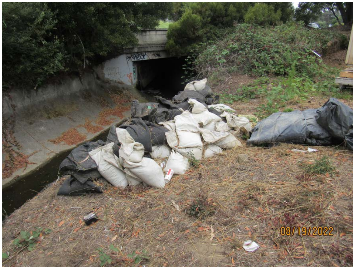
Photos 31 & 32 – Top photo shows old Colma Creek channel downstream of the El Camino Real bridge at the Mission Road intersection. Bottom photo shows illegal dumping of sandbags at 1791 Mission Road along the bank above the Old Colma Creek upstream of the diversion structure.