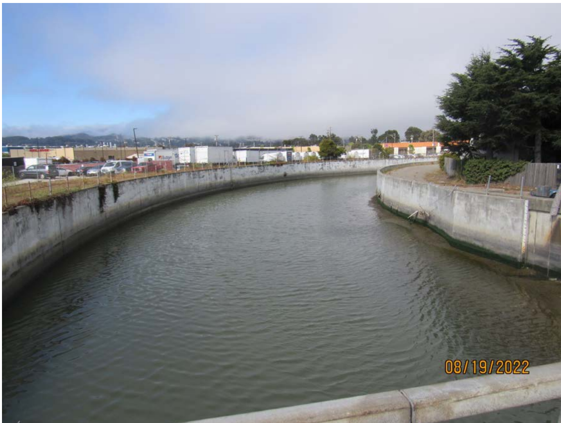
Photos 11 & 12 – Top photo shows homeless encampment on the southeast bank of Colma Creek at the Produce Avenue bridge. SSF Police Department and Caltrans are aware of the encampment. Bottom photo shows Colma Creek looking upstream from the Produce Avenue bridge.