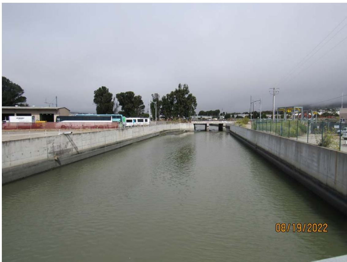
Photos 13 & 14 – Top photo shows Colma Creek looking downstream from the San Mateo Avenue bridge. Bottom photo shows Colma Creek looking upstream from the San Mateo Avenue bridge.