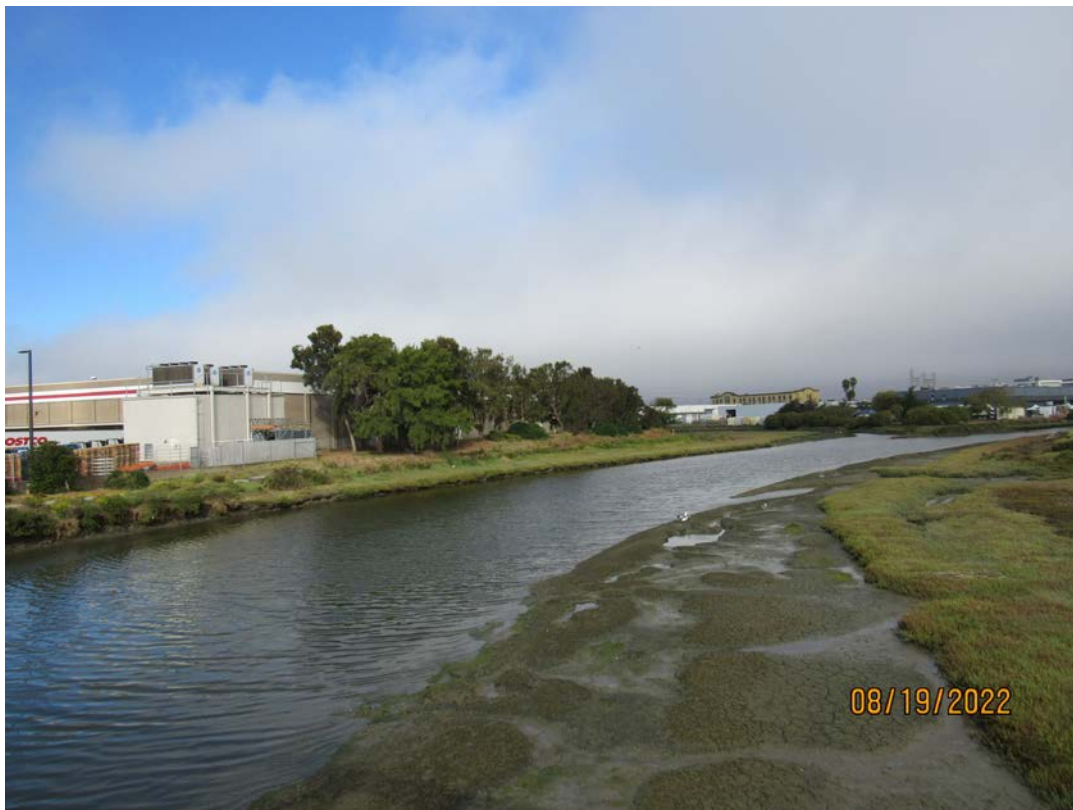
Photos 1 & 2 – Top photo shows Colma Creek looking downstream from the Bay Trail pedestrian bridge. Bottom photo shows Colma Creek looking upstream from the pedestrian bridge.