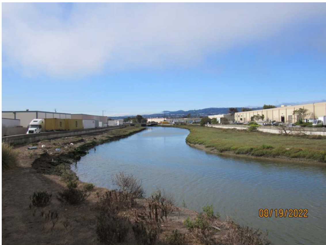
Photos 5 & 6 – Top photo shows Colma Creek looking upstream from the Utah Avenue bridge. Bottom photo shows Colma Creek looking downstream toward the Utah Avenue Bridge.