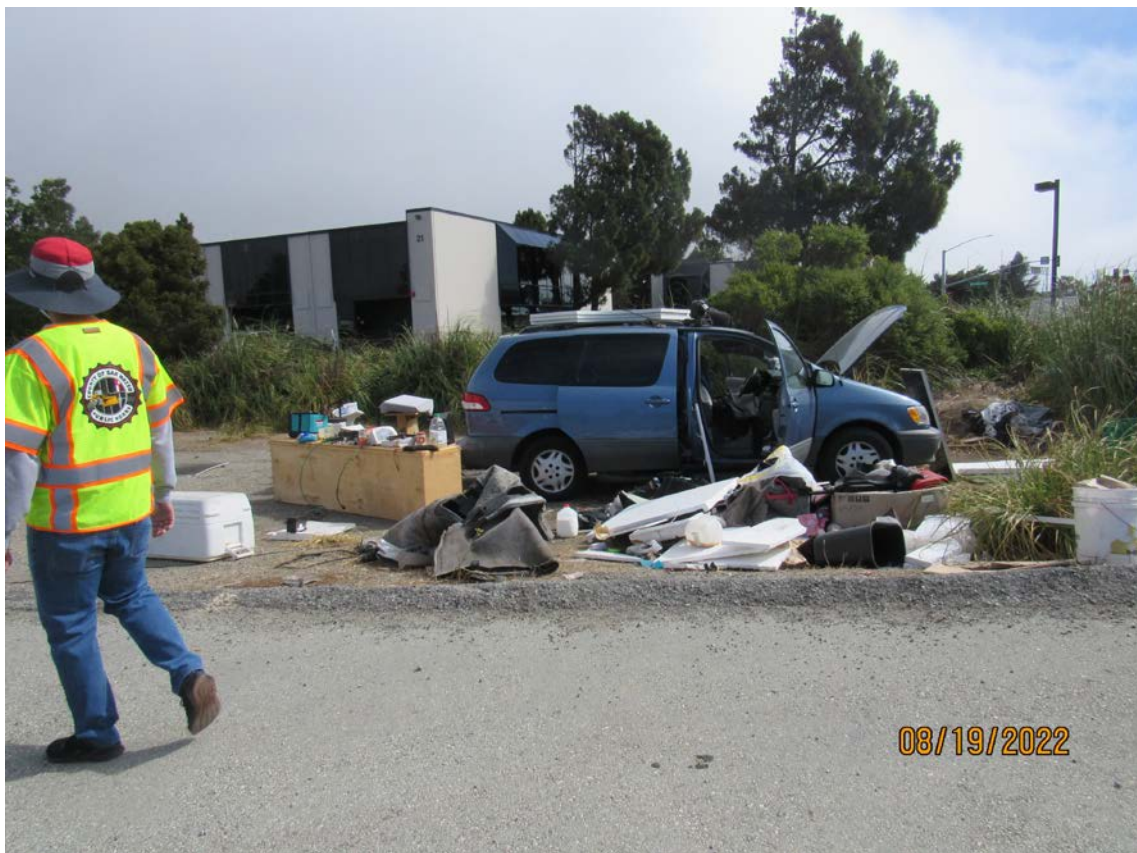
Photos 15 & 16 – Top photo shows cut fence upstream of the San Mateo Avenue bridge. Bottom photo shows homeless encampment upstream of the San Mateo Avenue bridge. SSF Police Department is aware of the encampment.