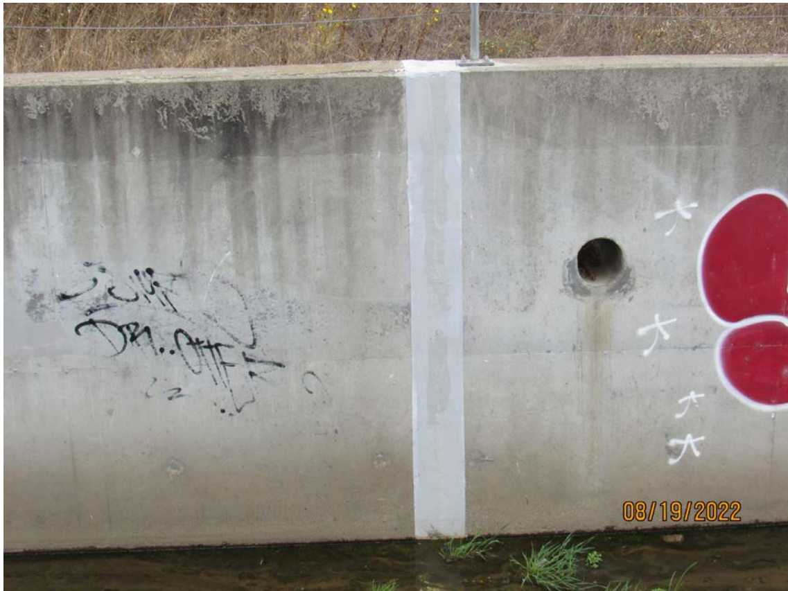
Photos 29 & 30 – Top photo shows Colma Creek looking downstream from the Costco pedestrian bridge. Bottom photo shows expansion joint applied with sealant between Mission Road box culvert and McLellan Drive.