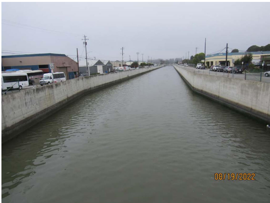
Photos 17 & 18 – Top photo shows Colma Creek looking downstream of the Linden Avenue bridge. Bottom photo shows Colma Creek looking upstream from the Linden Avenue bridge.