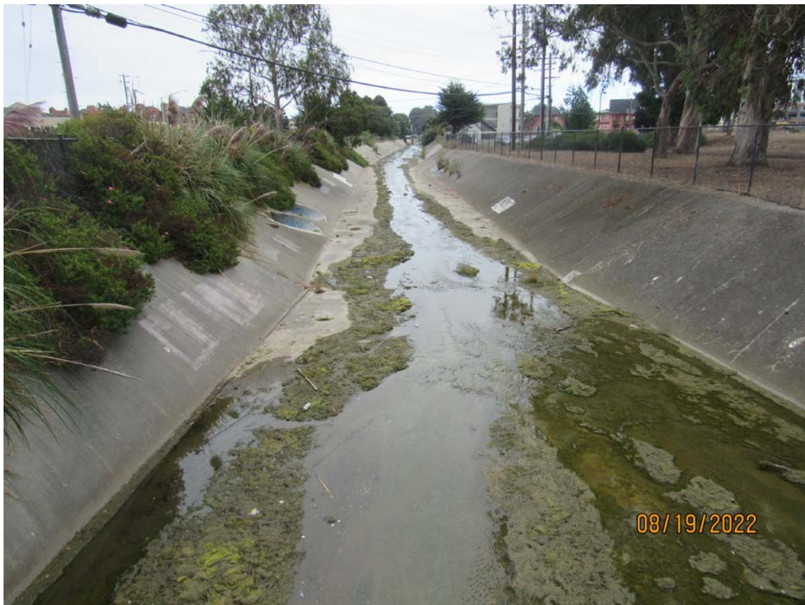
Photos 23 & 24 – Top photo shows Colma Creek looking upstream from Orange Park towards the 12-Mile Creek confluence and overgrown vegetation in the weepholes. Bottom photo shows Colma Creek looking downstream from the Centennial Way pedestrian bridge.