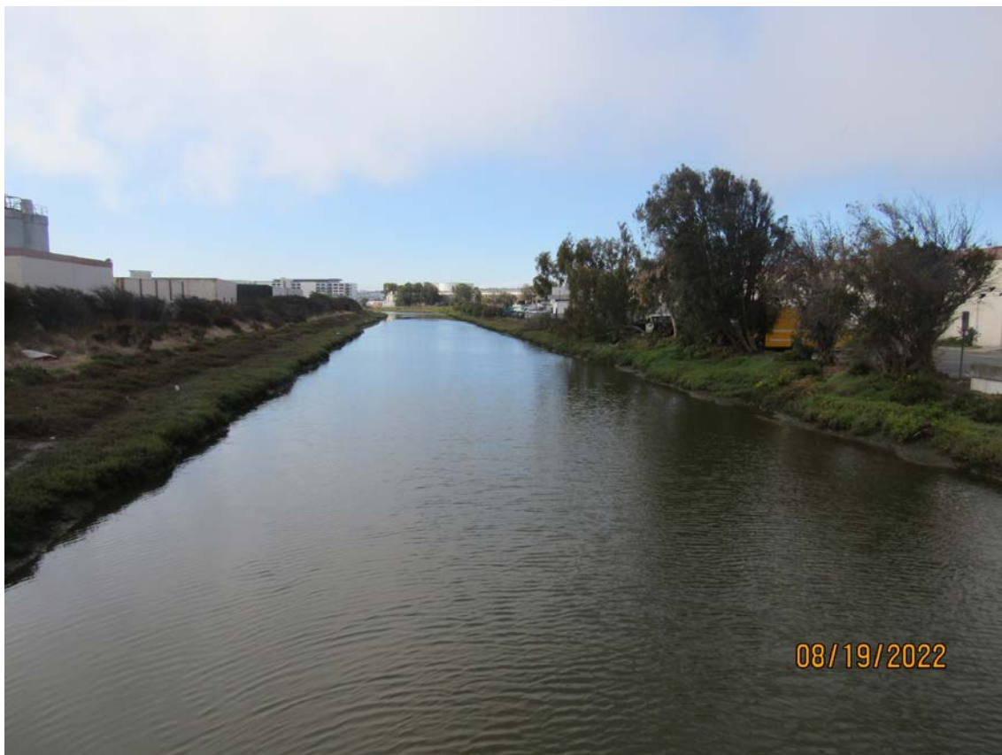
Photos 3 & 4 – Top photo shows new homeless encampment within Mitigation Site 2A downstream of Utah Avenue bridge. OneShoreline has been informed of the encampment. Bottom photo shows Colma Creek looking downstream from the Utah Avenue bridge.