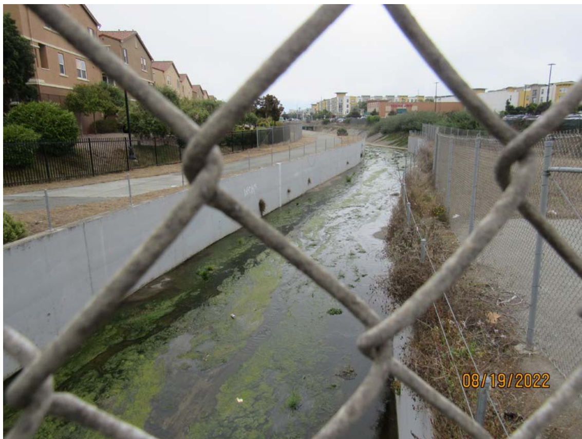
Photos 27 & 28 – Top photo shows Colma Creek looking downstream from the SSF BART station culvert. Bottom photo shows Colma Creek looking upstream from the Costco pedestrian bridge. The Town of Colma completed vegetation removal along the access road.