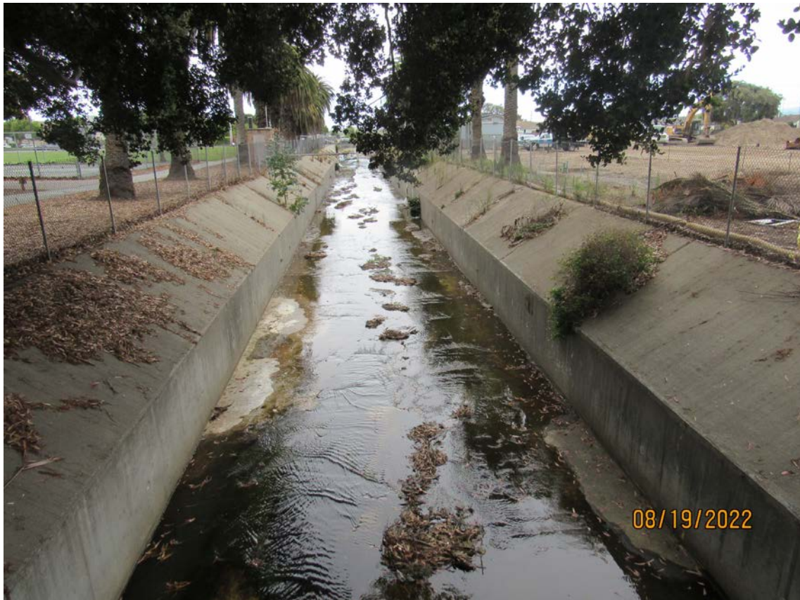
Photos 21 & 22 – Top photo shows Colma Creek looking upstream from the Orange Avenue bridge. Bottom photo shows Colma Creek looking downstream from the Orange Park pedestrian bridge. Overgrown vegetation observed in the wall joints between the Orange Avenue bridge and Orange Park pedestrian bridge.