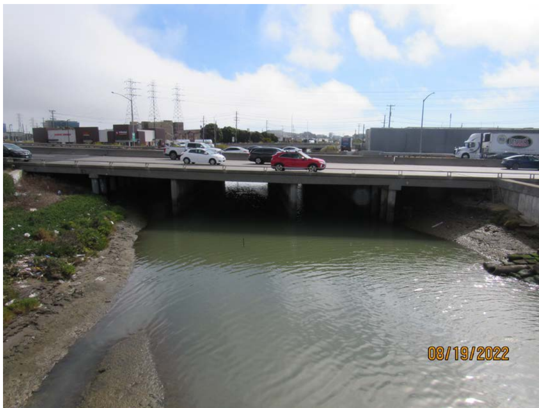
Photos 9 & 10 – Top photo shows Colma Creek looking upstream from the S. Airport Blvd. bridge. Bottom photo shows Colma Creek looking downstream towards the Highway 101 bridge from the Produce Avenue bridge.