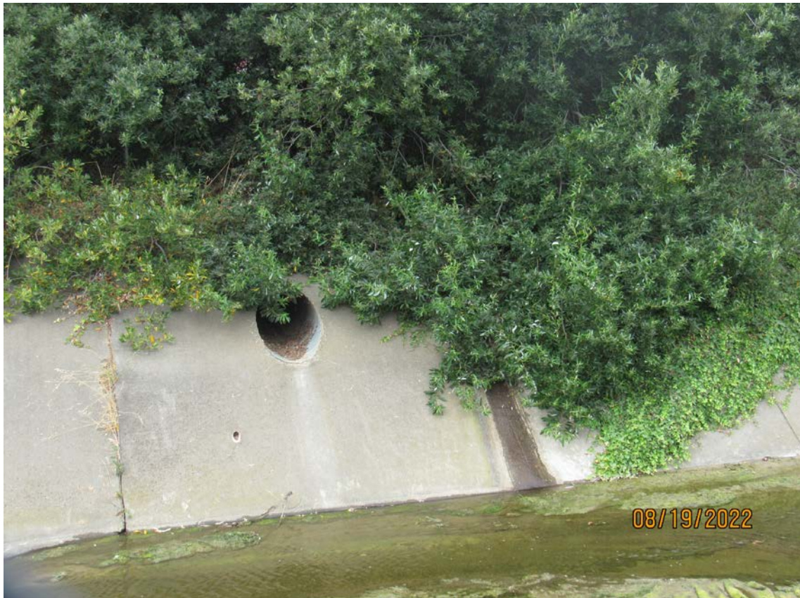
Photos 25 & 26 – Top photo shows Colma Creek looking upstream from the Centennial Way pedestrian bridge. Bottom photo shows overgrown vegetation along the southern wall upstream on Centennial Way pedestrian bridge.