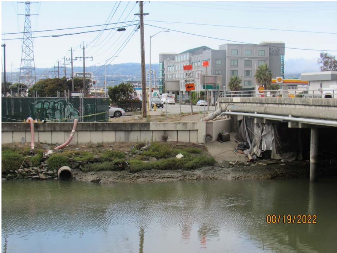
Photos 7 & 8 – Top photo shows Colma Creek looking upstream toward the S. Airport Blvd. bridge. Bottom photo shows homeless encampment beneath S. Airport Blvd. bridge. OneShoreline has been informed of the encampment.