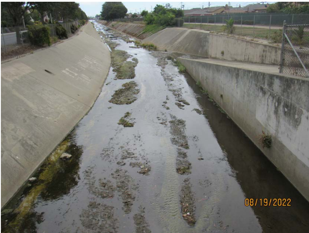
Photos 19 & 20 – Top photo shows Colma Creek looking upstream from the Spruce Avenue bridge. Bottom photo shows Colma Creek looking downstream from the Orange Avenue bridge.