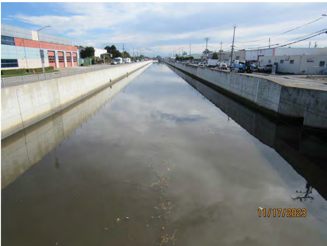
Photos 25 & 26 – Top photo shows Colma Creek looking upstream from Spruce Avenue bridge. Bottom photo shows Colma Creek looking downstream from Spruce Avenue bridge.