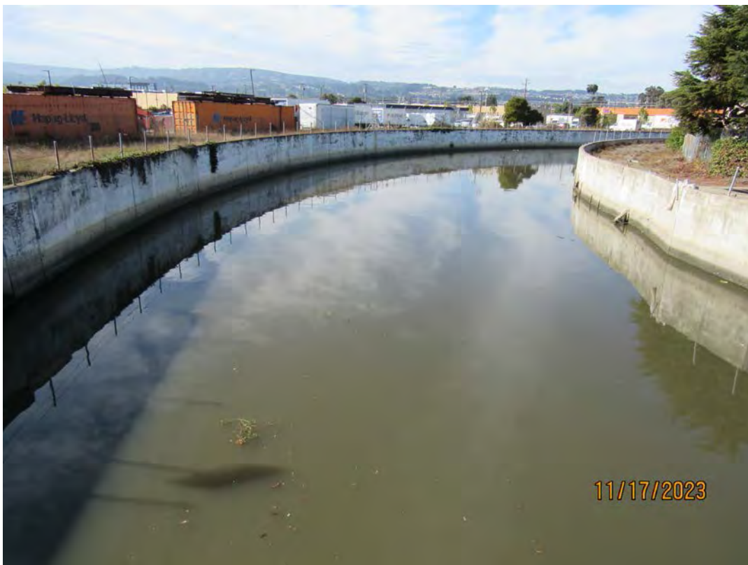
Photos 15 & 16 – Top photo shows Colma Creek looking downstream from the Produce Avenue bridge. Bottom photo shows Colma Creek looking upstream from the Produce Avenue bridge.