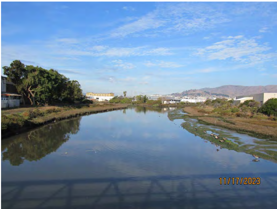
Photos 1 & 2 – Top photo shows Colma Creek looking downstream from the Bay Trail pedestrian bridge. Bottom photo shows Colma Creek looking upstream from the pedestrian bridge.