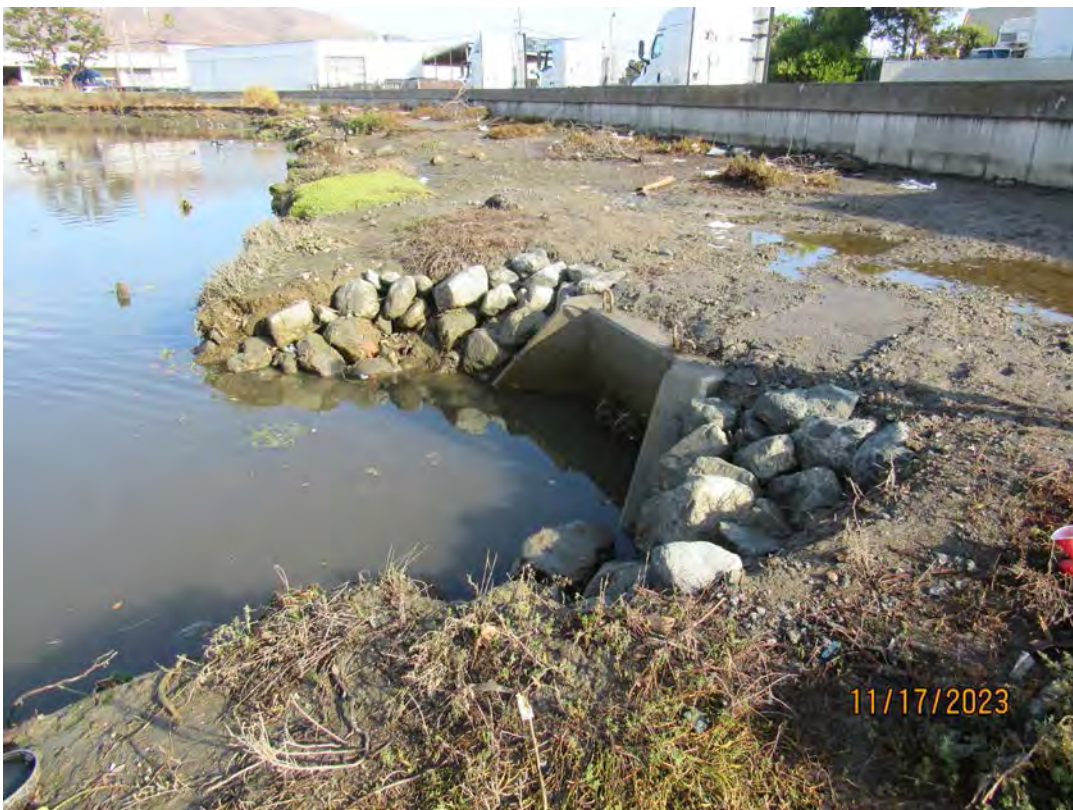
Photos 7 & 8 – Top and bottom photos show recently repaired culvert outfalls near Utah Ave.