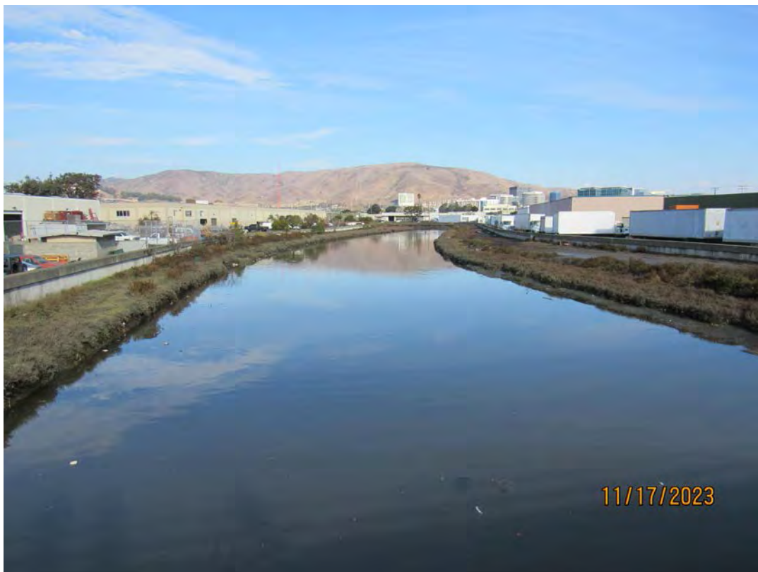
Photos 5 & 6 – Top photo shows Colma Creek looking downstream from the Utah Avenue bridge. Bottom photo shows Colma Creek looking upstream from the Utah Avenue Bridge.