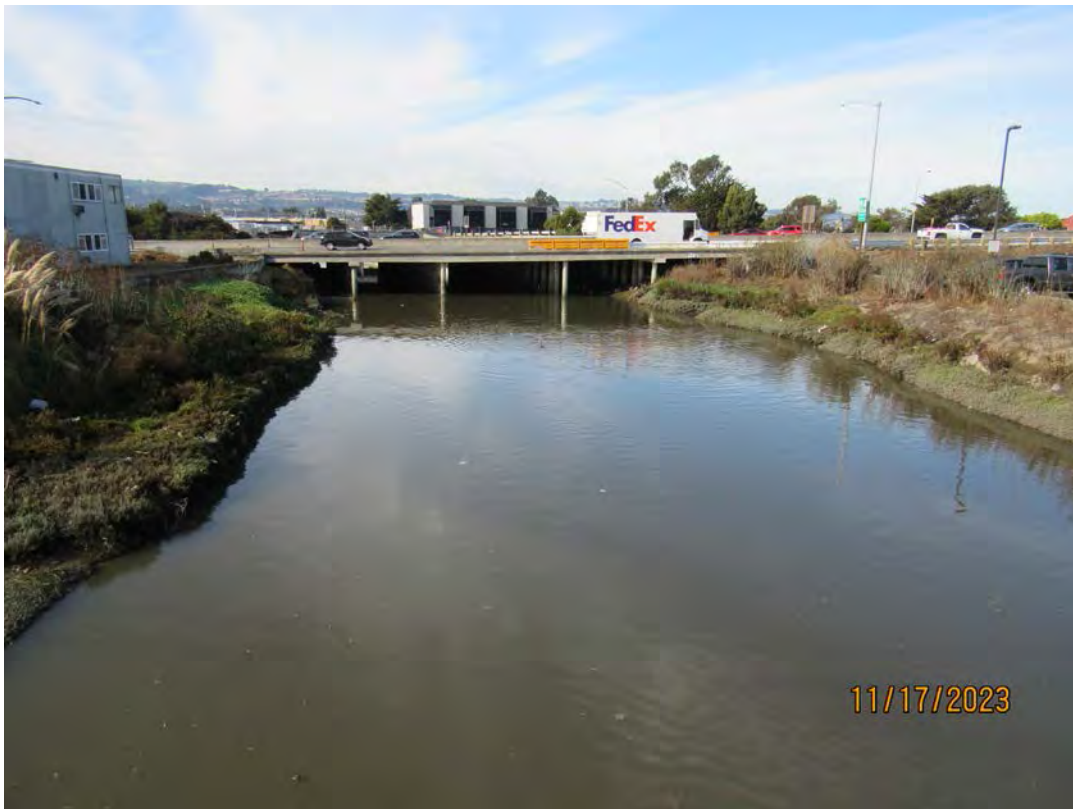
Photos 11 & 12 – Top photo shows invasive vegetation on the upper bank of Colma Creek adjacent to Mitchell Ave. Bottom photo shows Colma Creek looking upstream from the S. Airport Blvd. bridge.