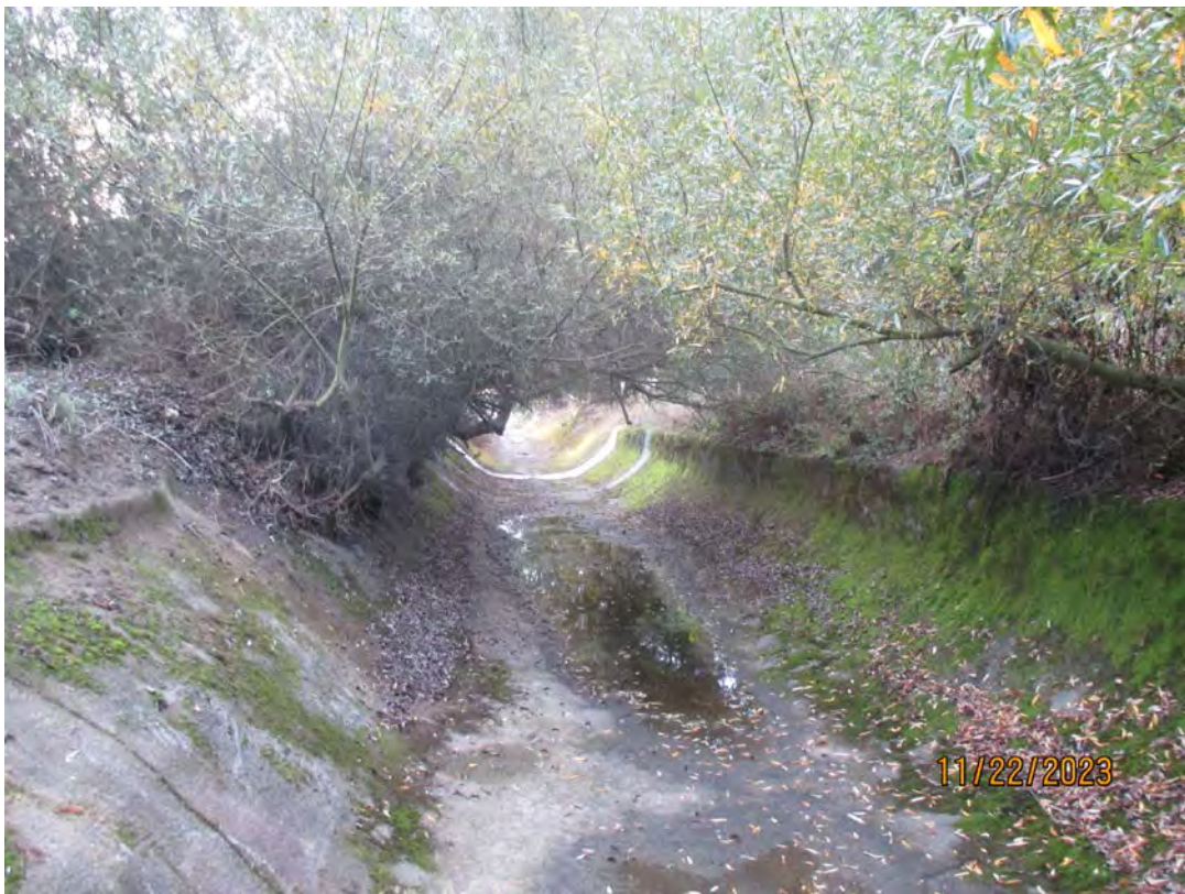
Photos 41 & 42 – Top photo shows old Colma Creek channel downstream of the El Camino Real bridge at the Mission Road intersection. Bottom photo shows Colma Creek channel facing downstream from the junction with the Old Channel.