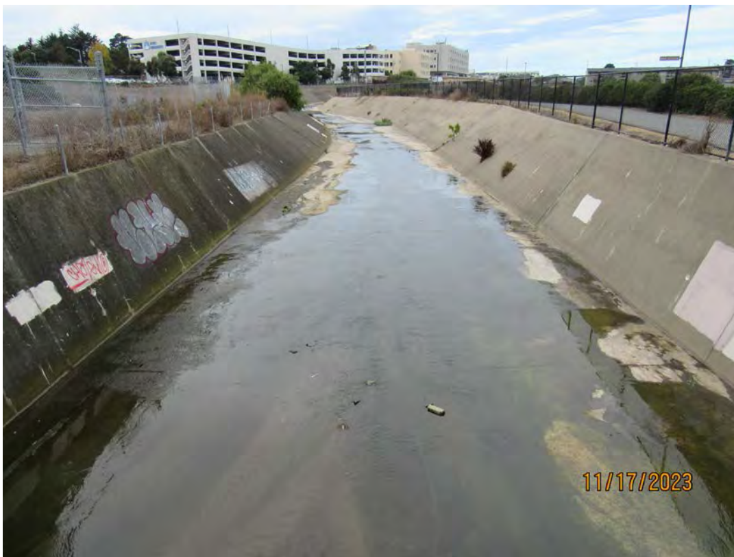
Photos 33 & 34 – Top photo shows Colma Creek looking downstream from the Centennial Way pedestrian bridge. Bottom photo shows Colma Creek looking upstream from the Centennial Way pedestrian bridge.