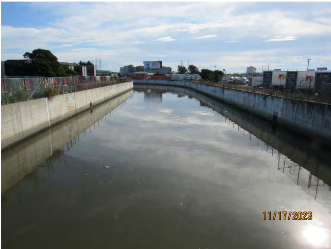
Photos 19 & 20– Top photo shows debris and encampment cleared at Produce Avenue bridge. Bottom photo shows Colma Creek looking downstream from the San Mateo Avenue bridge.