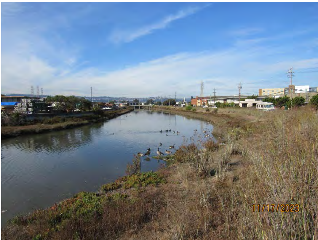
Photos 9 & 10 – Top photo shows Colma Creek looking downstream towards the Utah Avenue bridge. Bottom photo shows Colma Creek looking upstream towards the S. Airport Blvd. bridge.