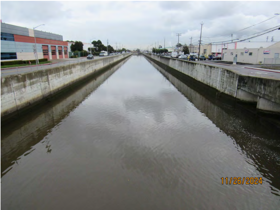
Photos 21 & 22 – Top photo shows Colma Creek looking upstream from Spruce Avenue bridge. Bottom photo shows Colma Creek looking downstream from Spruce Avenue bridge.