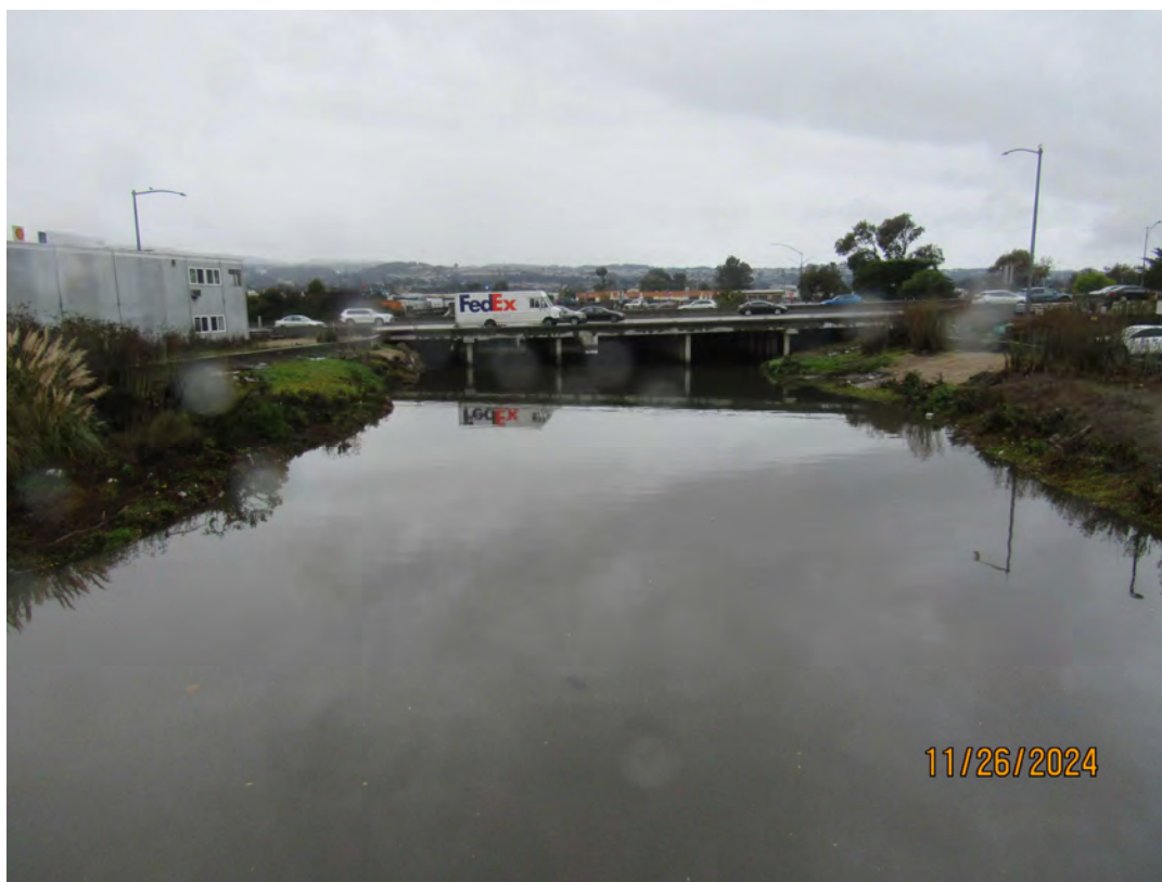
Photos 9 & 10 – Top photo shows Colma Creek looking downstream from the S. Airport Blvd. bridge. Bottom photo shows Colma Creek looking upstream from S. Airport Blvd. facing the Hwy 101 crossing. Trash and illegal dumping related to encampment activities under the S. Airport Blvd. bridge were visible in this vicinity.