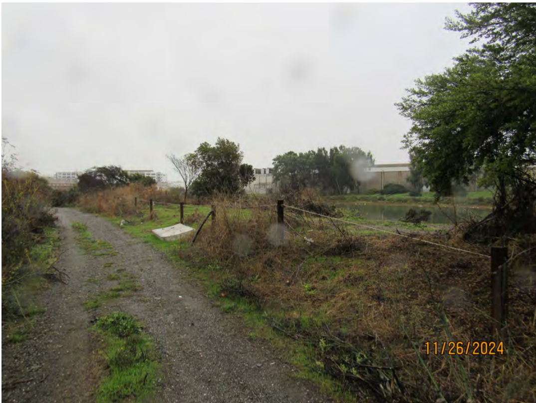
Photos 3 & 4 – Top and bottom photos show access road and mitigation Site 2 between the Bay Trail pedestrian bridge and Utah Avenue. One new encampment as well as some trash and illegal dumping were observed. OneShoreline and County planning on clearing trash/debris in these areas and maintain/replace native vegetation during future cleanup/planting events.