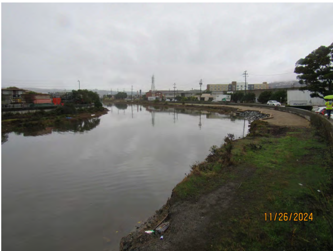
Photos 7 & 8 – Top photo shows Colma Creek looking downstream towards the Utah Avenue bridge. Bottom photo shows Colma Creek looking upstream towards the S. Airport Blvd. bridge. Trash from various sources including storm drains and illegal dumping continues to be an impairment to the channel in this section.