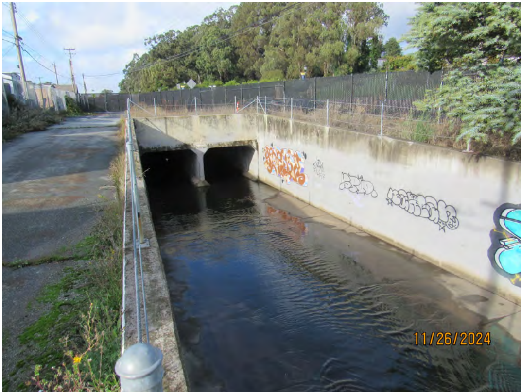
Photos 35 & 36 – Top photo shows Colma Creek looking downstream from the outlet of Mission Road Box Culvert. Bottom photo Colma creek looking upstream at the Mission Road Box Culvert.