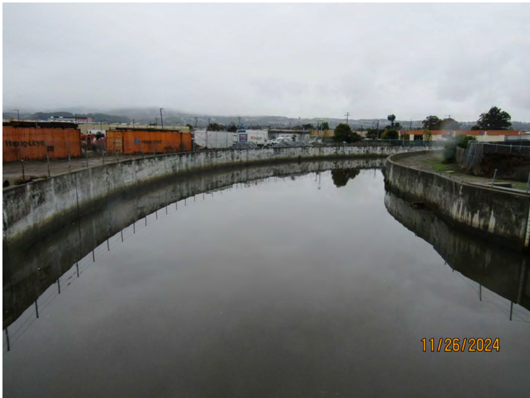
Photos 13 & 14 – Top photo shows Colma Creek looking downstream from the Produce Avenue bridge facing the Hwy 101 crossing. Bottom photo shows Colma Creek looking upstream from the Produce Avenue bridge. Access roads in bottom photo were cleared of vegetation and debris by the County on behalf of OneShoreline as part of this year's maintenance work