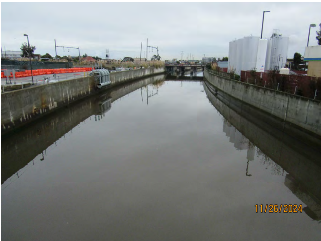
Photos 19 & 20 – Top photo shows Colma Creek looking upstream from Linden Avenue bridge. Bottom photo shows Colma Creek looking downstream from the Linden Avenue bridge. The areas outside the channel walls were clear of active encampments.