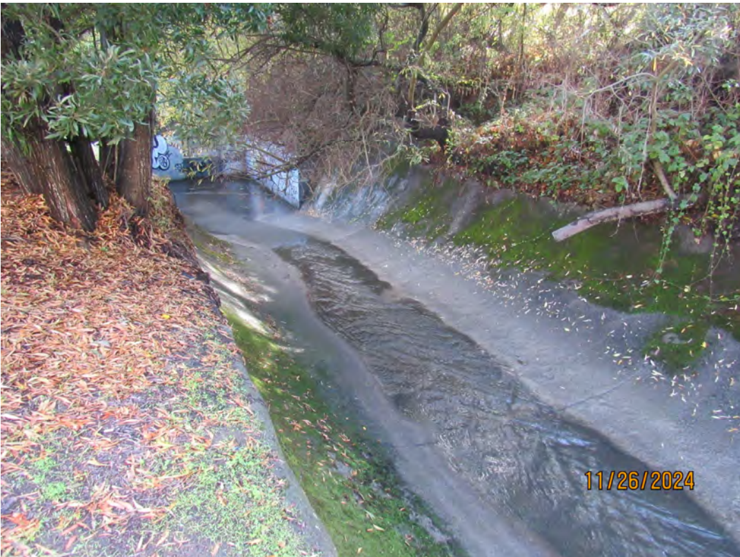
Photos 37 & 38 – Top photo shows old Colma Creek channel downstream of the El Camino Real bridge at the Mission Road intersection. Bottom photo shows Colma Creek channel facing downstream looking at the diversion structure and junction with the Old Channel.