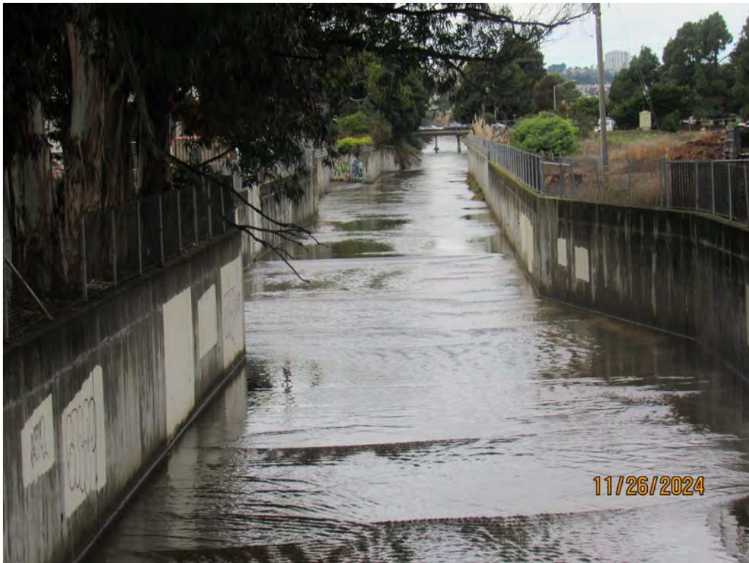
Photos 27 & 28 – Top photo shows Colma Creek looking downstream of the pedestrian bridge in Orange Memorial Park. Bottom photo shows Colma Creek looking upstream towards the 12-Mile Creek confluence. Vegetation clearing in the wall joints and weepholes in this section of channel was completed during this year's maintenance activities by the County on behalf of OneShoreline.