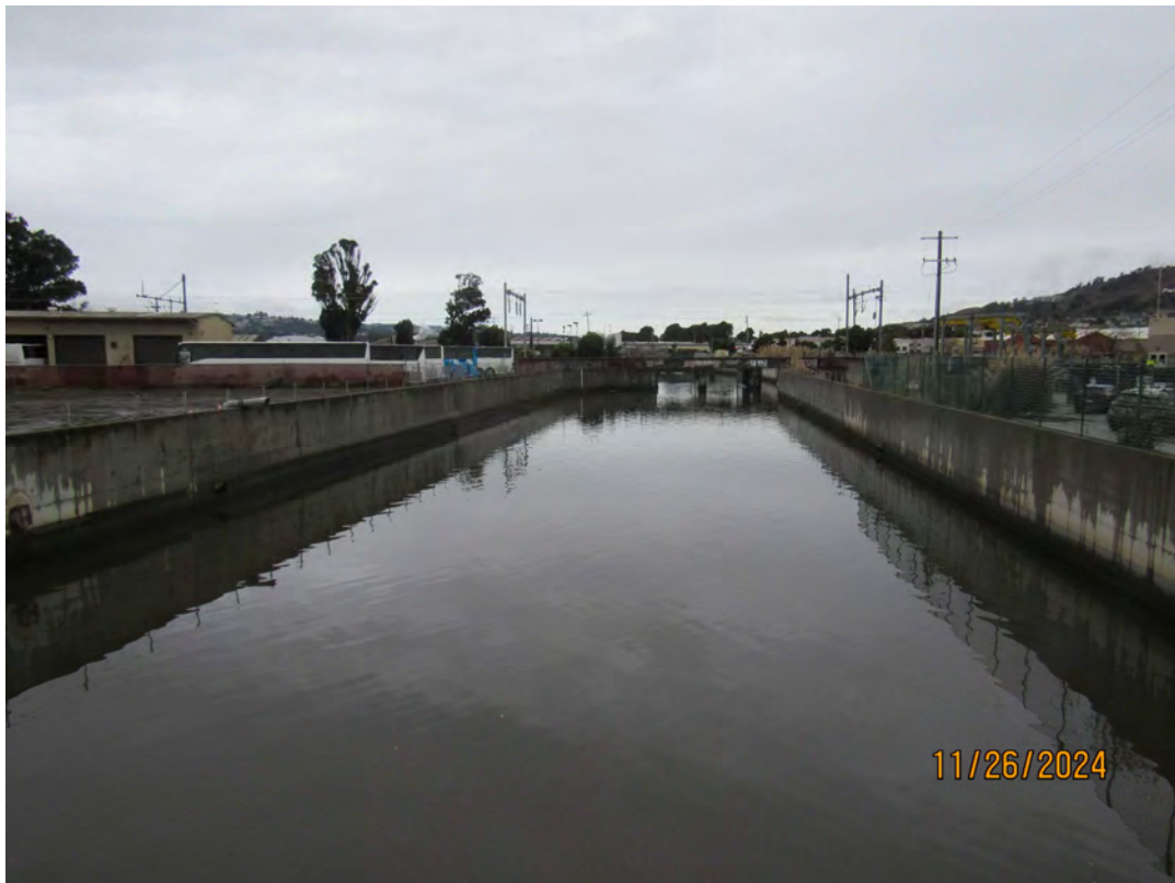
Photos 17 & 18 – Top photo shows Colma Creek looking downstream from the San Mateo Avenue bridge. Access roads in top photo were cleared of vegetation and debris as part of this year's maintenance work. Bottom photo shows Colma Creek looking upstream from the San Mateo Avenue bridge. This section was dredged of sediment by the County contractor on behalf of OneShoreline as part of this year's maintenance work.