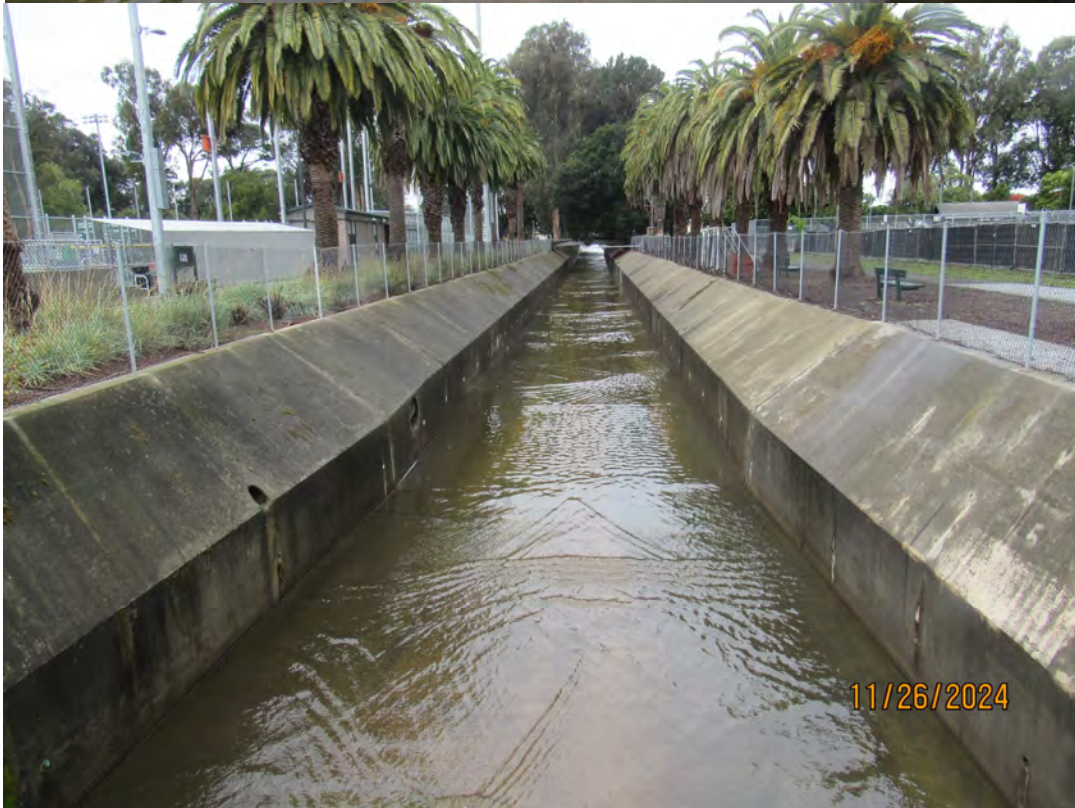
Photos 25 & 26 – Top photo shows Colma Creek looking downstream from the Orange Avenue bridge. Bottom photo shows Colma Creek looking upstream from Orange Avenue bridge. The County on behalf of OneShoreline removed and trimmed vegetation in the joints and weepholes in this section of channel during this year's maintenance activity.