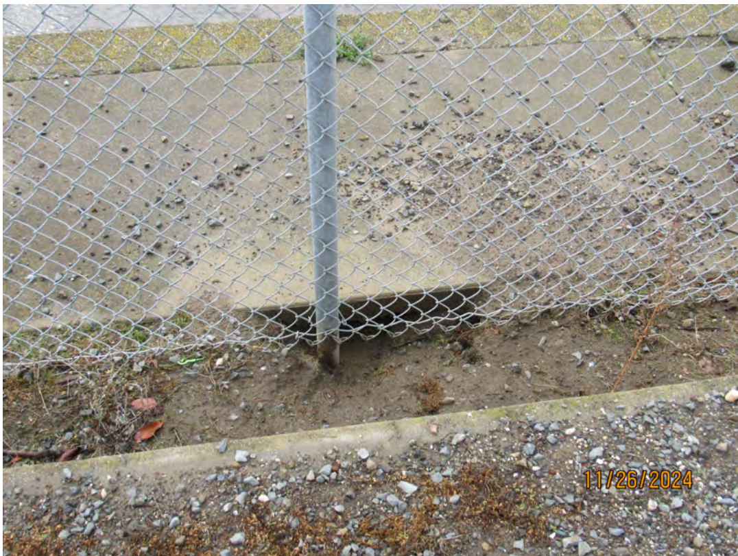
Photos 23 & 24 – Top photo shows minor debris accumulated at the dissipator teeth upstream of the Spruce Avenue bridge. Bottom photo shows void underneath the north sidewalk upstream of the Spruce Avenue bridge and dissipator teeth. County staff recommend monitoring the void in future inspections. This area is within the section of channel currently being evaluated by the conditions assessment geotechnical investigation project.