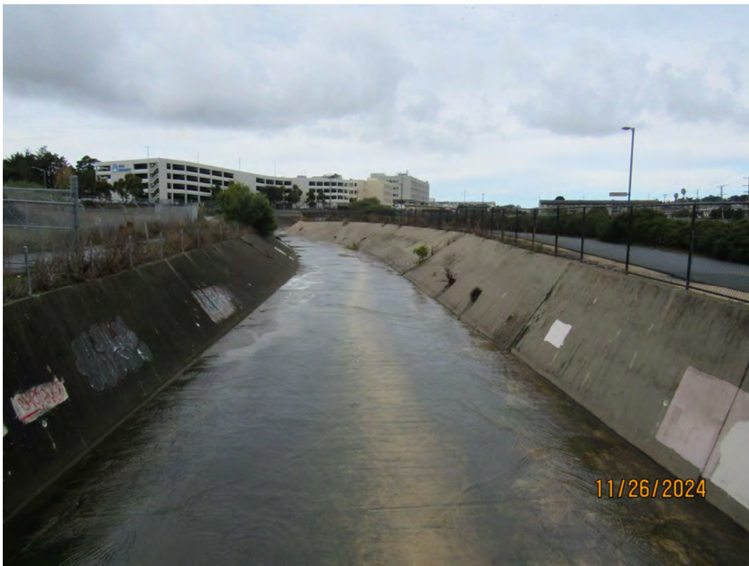
Photos 29 & 30 – Top photo shows Colma Creek looking downstream at the Centennial Way pedestrian bridge. Bottom photo shows Colma Creek looking upstream from the Centennial Way pedestrian bridge.