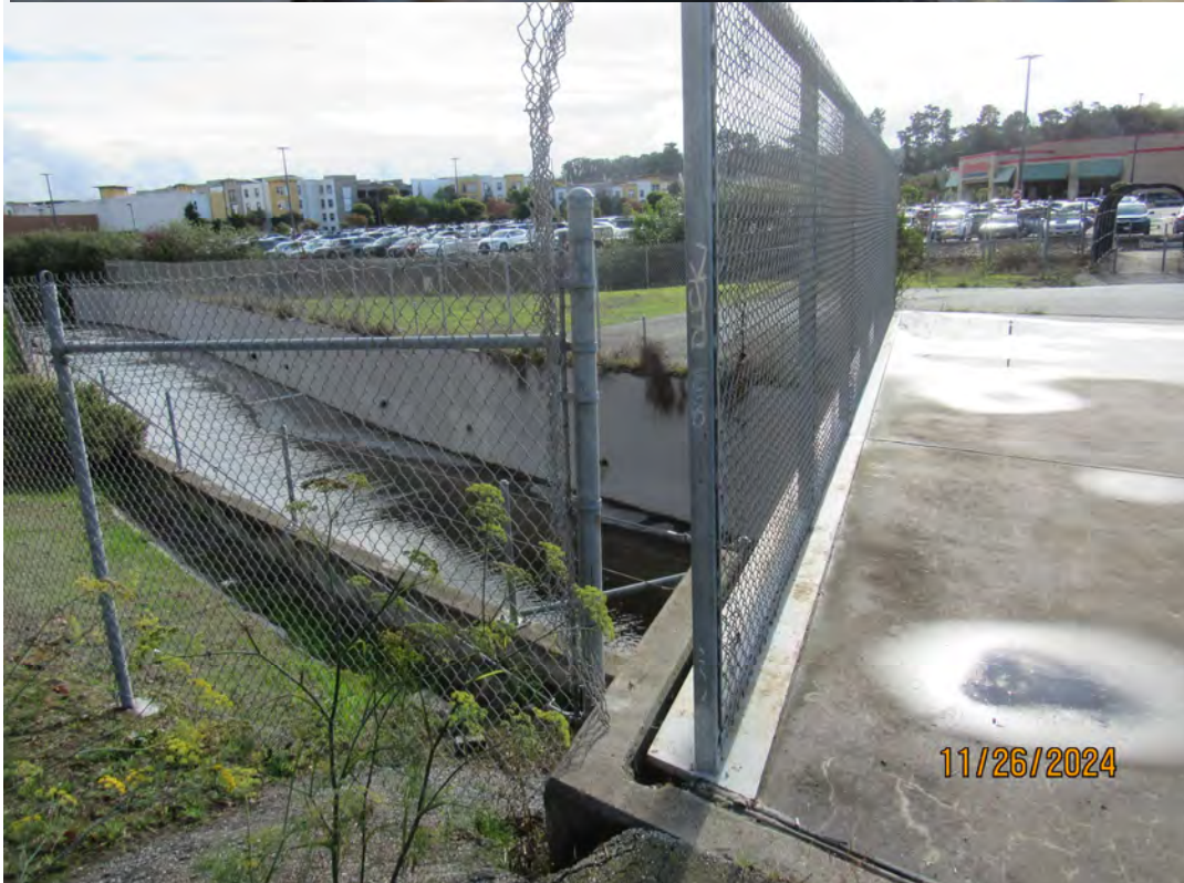
Photos 33 & 34 – Top photo shows Colma Creek looking upstream from Costco pedestrian bridge. Note that walls remain graffiti free in this section. However, the channel upstream and downstream of here continues to receive fresh graffiti. Bottom photo shows cut in fence on south end of pedestrian bridge downstream. County also observed locks removed at downstream gate and recommends OneShoreline to coordinate with Colma staff to repair fence and replace lock for access.