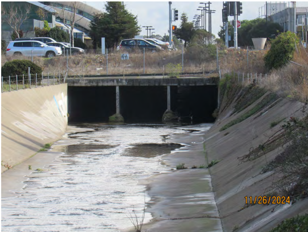
Photos 31 & 32 – Top photo shows Colma Creek looking downstream from the SSF BART Station culvert. Bottom photo shows Colma Creek looking downstream from the pedestrian trail near Costco at the box culvert.