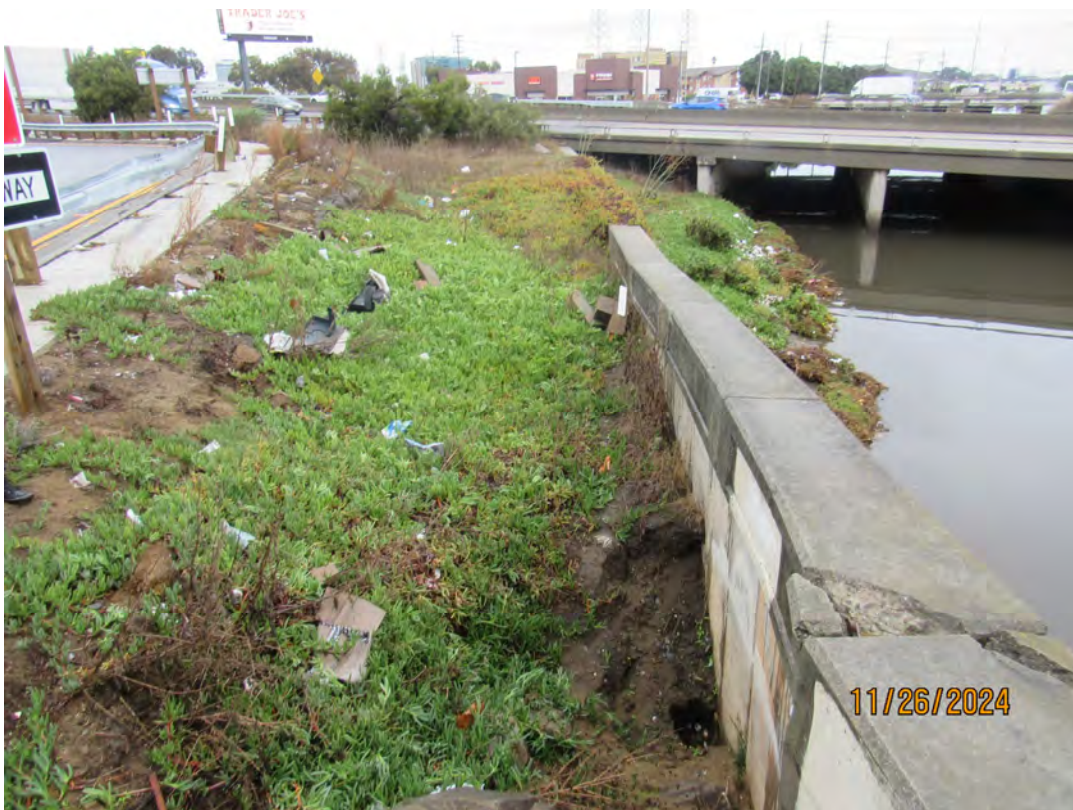
Photos 15 & 16 – Top photo shows damage on channel wall and partially blocked culvert outfall downstream from the Produce Avenue bridge facing the Hwy 101 crossing. Bottom photo shows void outside the channel wall. County recommends continuing to monitor the area and contacting Caltrans to clear the drain inlet.