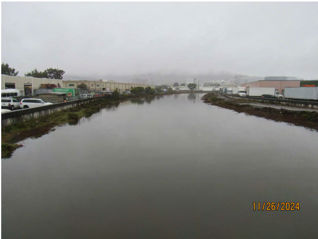
Photos 5 & 6 – Top photo shows Colma Creek looking downstream from the Utah Avenue bridge. Bottom photo shows Colma Creek looking upstream from Utah Avenue.