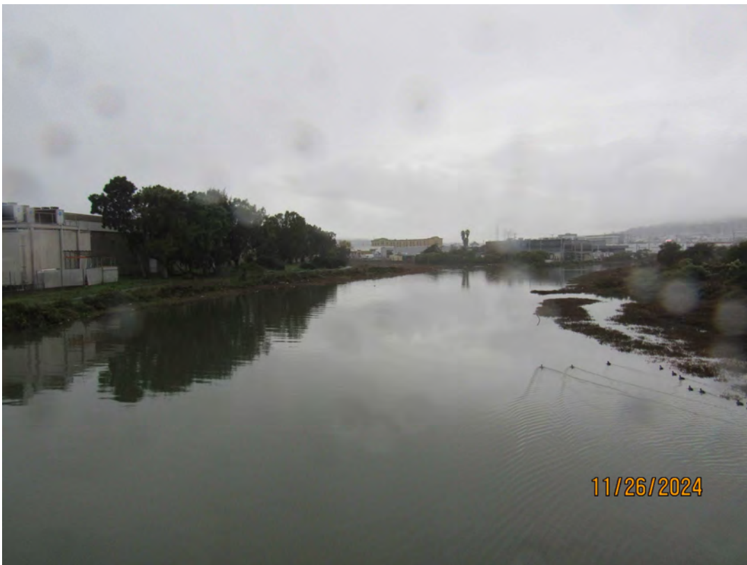
Photos 1 & 2 – Top photo shows Colma Creek looking downstream from the Bay Trail pedestrian bridge. Bottom photo shows Colma Creek looking upstream from the pedestrian bridge.