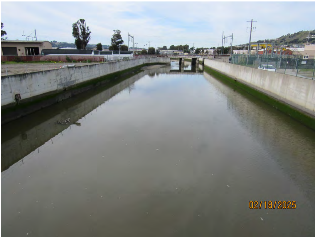
Photos 17 & 18 – Top photo shows Colma Creek looking downstream from the San Mateo Avenue bridge. Bottom photo shows Colma Creek looking upstream from the San Mateo Avenue bridge.