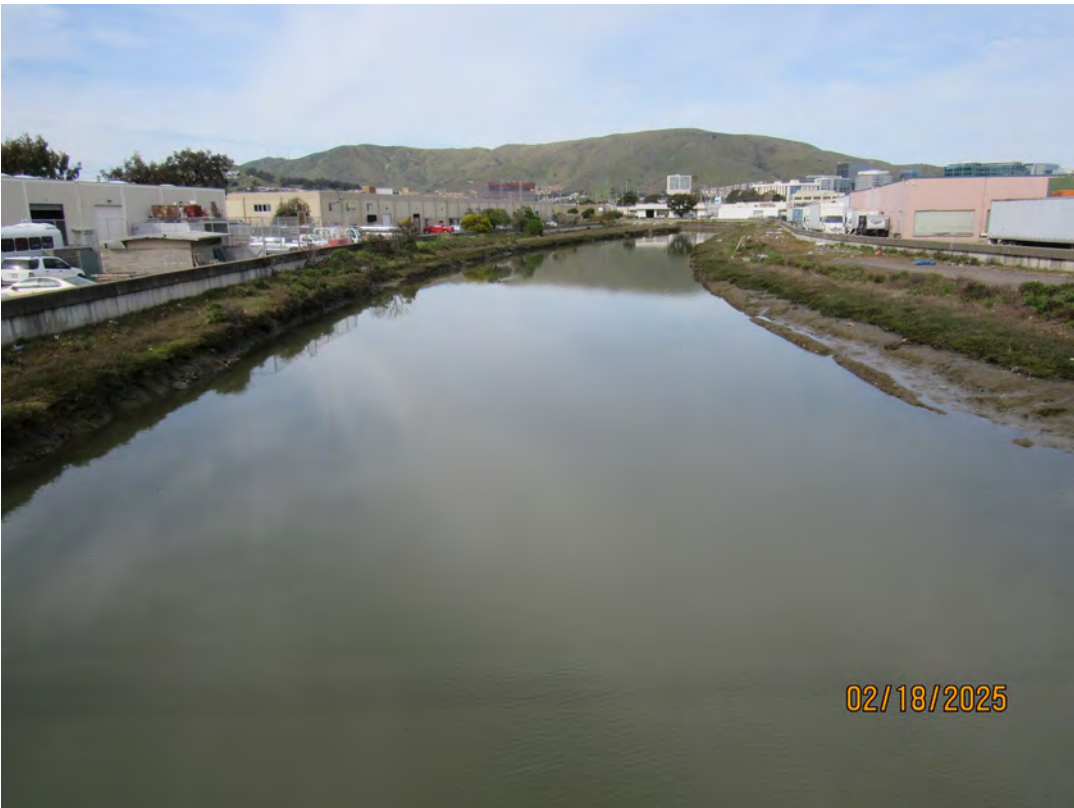
Photos 5 & 6 – Top photo shows Colma Creek looking downstream from the Utah Avenue bridge. Bottom photo shows Colma Creek looking upstream from Utah Avenue.