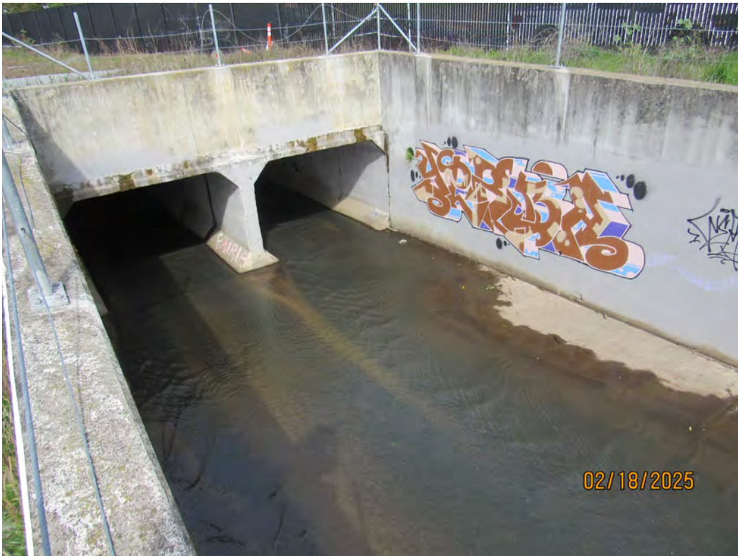
Photos 37 & 38 – Top and bottom photo shows Colma Creek looking upstream at the Mission Road Box Culvert.