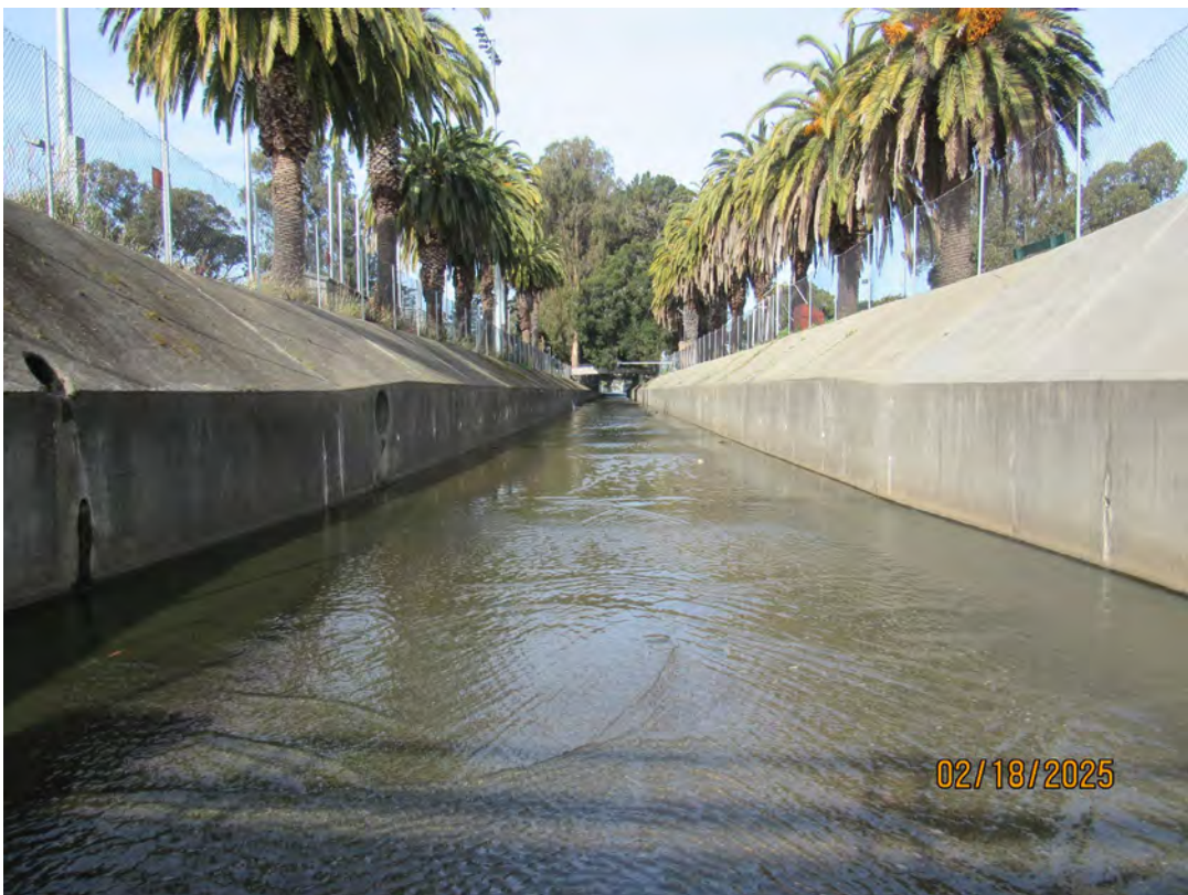
Photos 25 & 26 – Top photo shows Colma Creek looking downstream from the Orange Avenue bridge. Bottom photo shows Colma Creek looking upstream from Orange Avenue bridge.