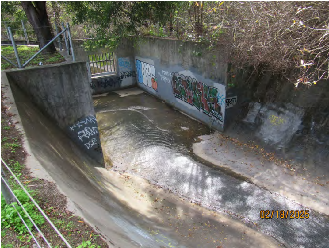
Photos 39 & 40 – Top photo shows old Colma Creek channel downstream of the El Camino Real bridge at the Mission Road intersection. Bottom photo shows Colma Creek channel facing downstream looking at the diversion structure and junction with the Old Channel.