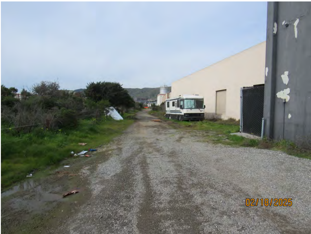
Photos 3 & 4 – Top and bottom photos show access road and mitigation Site 2 between the Bay Trail pedestrian bridge and Utah Avenue. Trash and illegal dumping as well as one potentially occupied motorhome were observed along the service road. No encampments observed along the banks of Colma Creek.