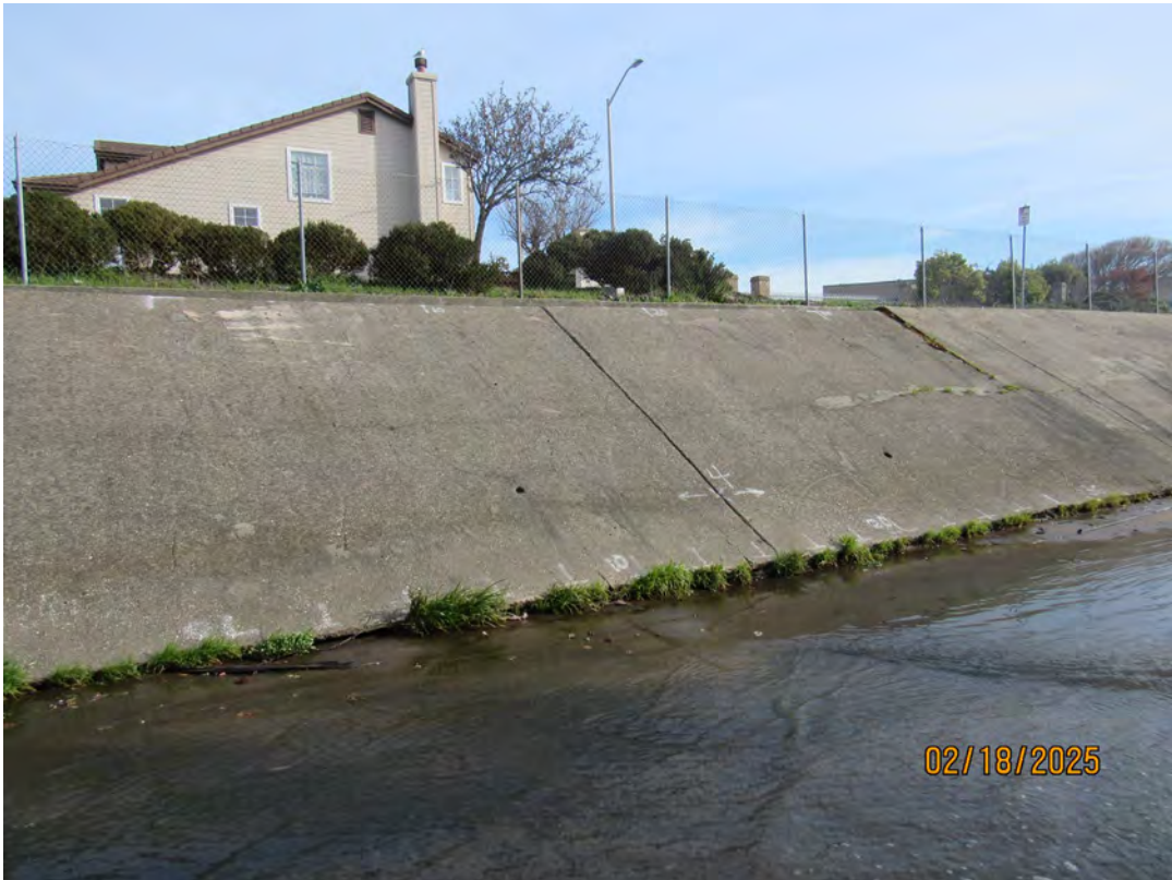
Photos 23 & 24 – Top photo shows minor debris accumulated at the dissipater teeth upstream of the Spruce Avenue bridge. Bottom photo shows trapezoidal wall separation at channel floor developing upstream of the Spruce Avenue bridge. This section was included in a geotechnical investigation to identify causes for the soil settlement. County recommends OneShoreline to continue monitoring the separation in future inspections.