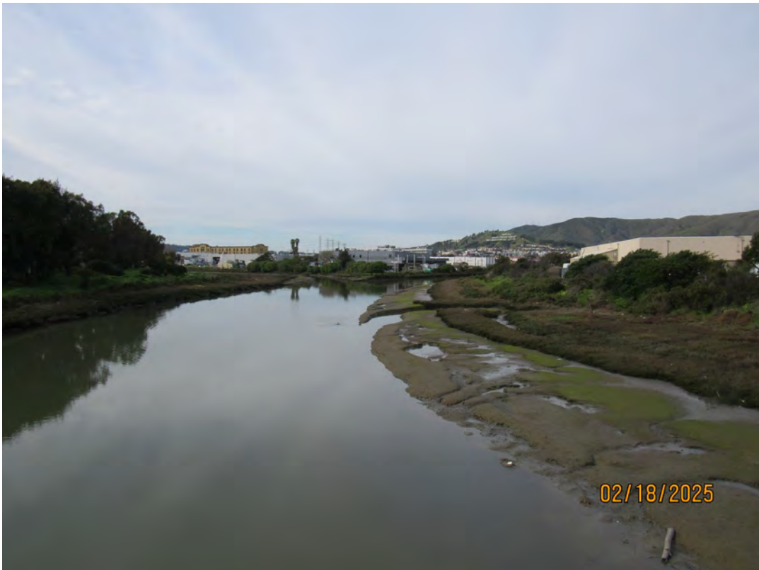
Photos 1 & 2 – Top photo shows Colma Creek looking downstream from the Bay Trail pedestrian bridge. Bottom photo shows Colma Creek looking upstream from the pedestrian bridge.