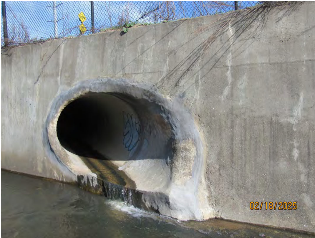
Photos 31 & 32 – Top photo shows degraded channel floor downstream from the BART box culvert. The 2023 condition assessment of the concrete channel in this section recommends continued monitoring of the defect in future inspections. Bottom photo shows repaired culvert downstream from the SSF BART Station.