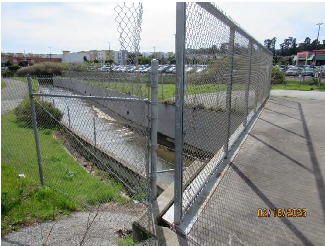
Photos 35 & 36 – Top photo shows Colma Creek looking upstream from Costco pedestrian bridge. Note that walls remain graffiti free in this section. However, the channel upstream and downstream of here continues to receive fresh graffiti. Bottom photo shows cut in fence on south end of pedestrian bridge downstream. County also observed locks removed at downstream gate and recommends OneShoreline to coordinate with Colma staff to repair fence and replace lock for access.