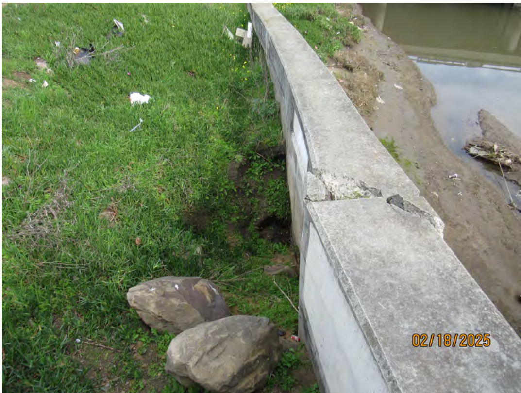
Photos 15 & 16 – Top photo shows damage on channel wall and partially blocked culvert outfall downstream from the Produce Avenue bridge facing the Hwy 101 crossing. Bottom photo shows void outside the channel wall. County recommends continuing to monitor the area and contacting Caltrans to clear vegetation at the drain inlet.