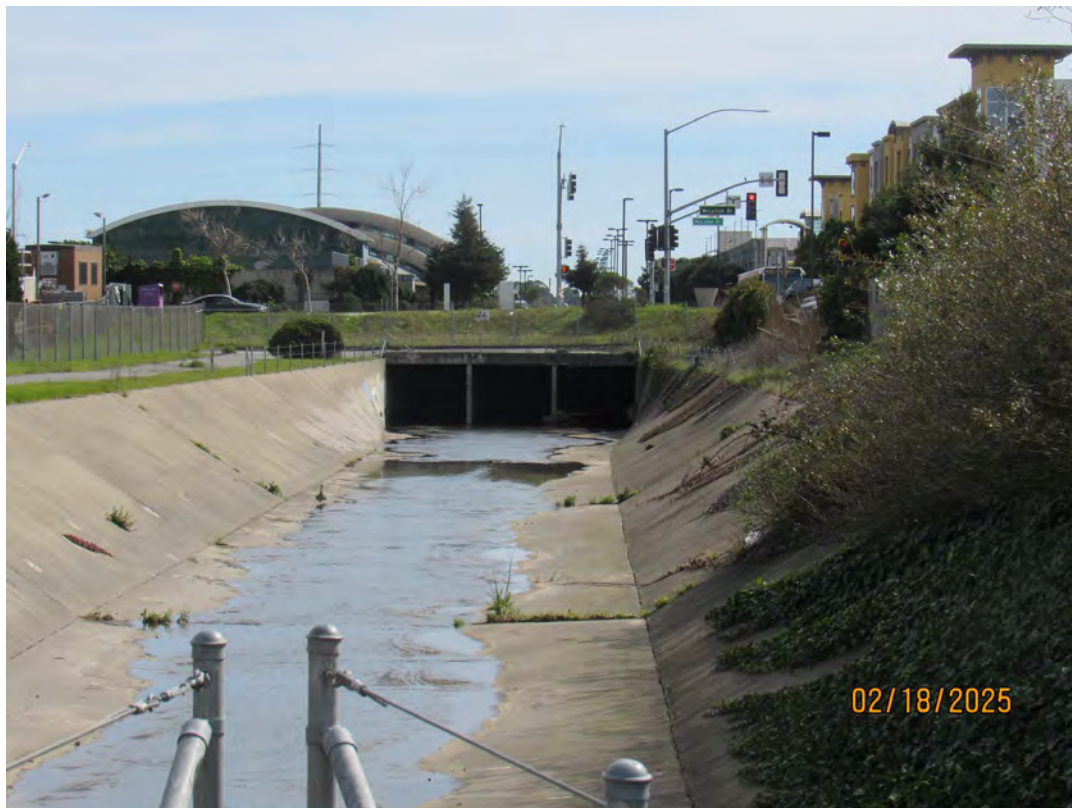
Photos 33 & 34 – Top photo shows Colma Creek looking downstream from channel section from the BART box culvert. Bottom photo shows Colma Creek looking downstream from the pedestrian trail near Costco at the box culvert.