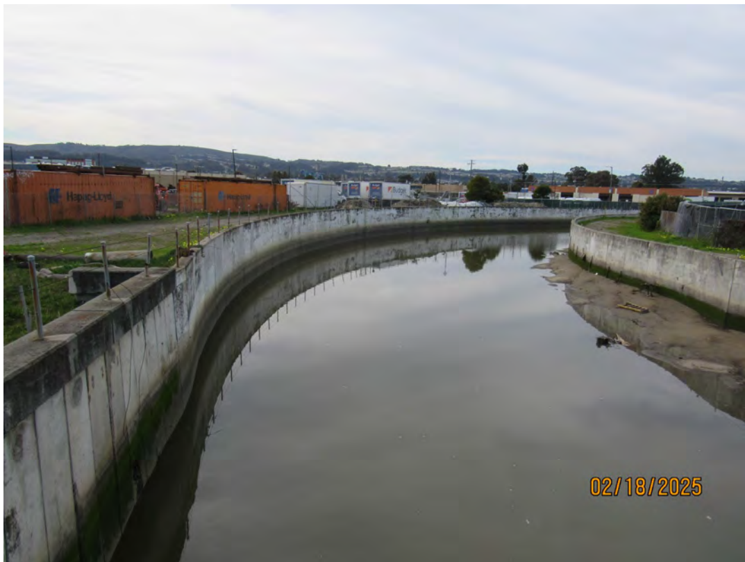
Photos 13 & 14 – Top photo shows Colma Creek looking downstream from the Produce Avenue bridge facing the Hwy 101 crossing. Bottom photo shows Colma Creek looking upstream from the Produce Avenue bridge.