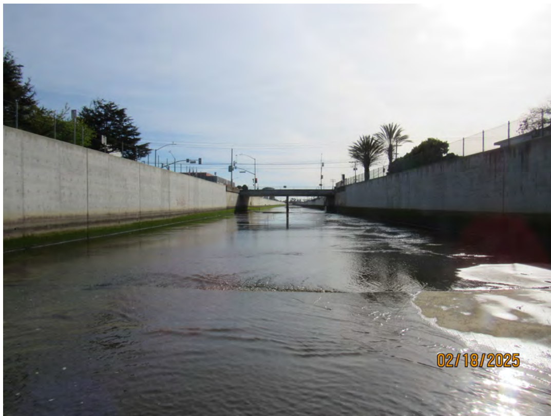
Photos 21 & 22 – Top photo shows Colma Creek looking upstream from dissipater teeth. Bottom photo shows Colma Creek looking downstream from dissipater teeth at Spruce Avenue bridge.