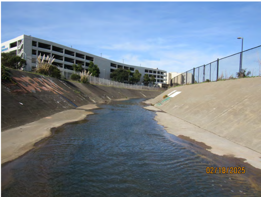
Photos 29 & 30 – Top photo shows Colma Creek looking downstream at the Centennial Way pedestrian bridge. Bottom photo shows Colma Creek looking upstream from the Centennial Way pedestrian bridge.