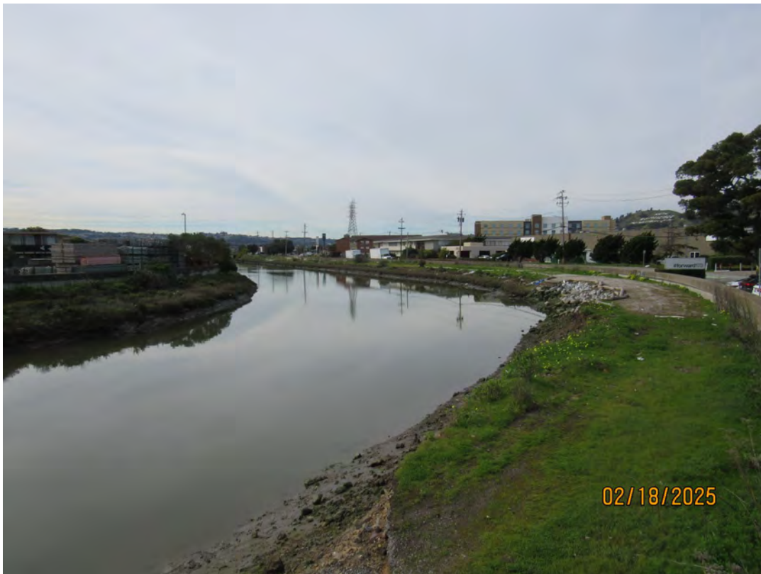
Photos 7 & 8 – Top photo shows Colma Creek looking downstream towards the Utah Avenue bridge. Bottom photo shows Colma Creek looking upstream towards the S. Airport Blvd. bridge. Trash from various sources including storm drains and illegal dumping continues to be an issue.