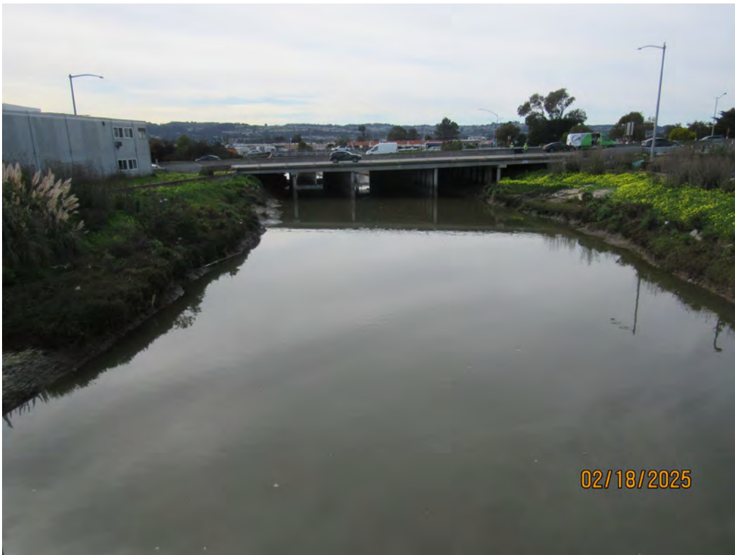
Photos 9 & 10 – Top photo shows Colma Creek looking downstream from the S. Airport Blvd. bridge. Bottom photo shows Colma Creek looking upstream from S. Airport Blvd. facing the Hwy 101 crossing. Trash from various sources including storm drains and illegal dumping continues to be an issue. No encampments observed under S. Airport Blvd..