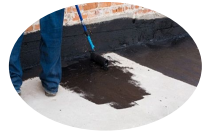
Sealants & membranes