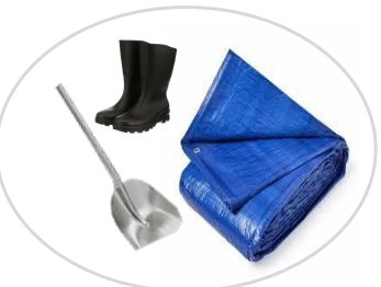
Clean up & protective gear $