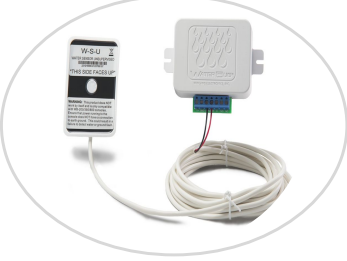
Flood alert system $