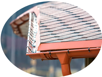
Gutters/ roof drainage $-$$