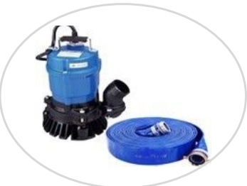
Portable water pump $