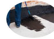
Sealants & membranes