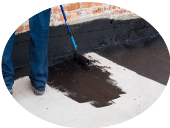
Sealants & membranes $