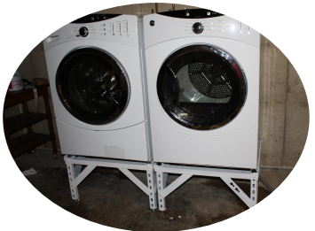
Utility platform $$