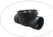
Backflow prevention valve