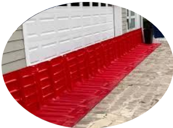
Flood barriers & gates $$$