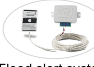
Flood alert system