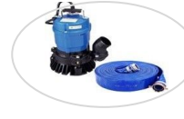
Portable water pump