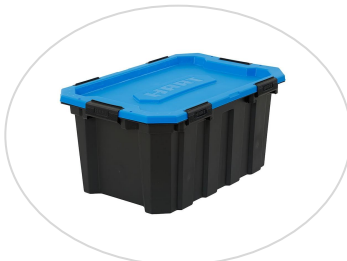
Waterproof Containers $