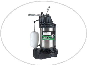
Sump pump $$