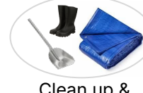
Clean up & protective gear