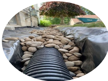
Ground drainage $-$$